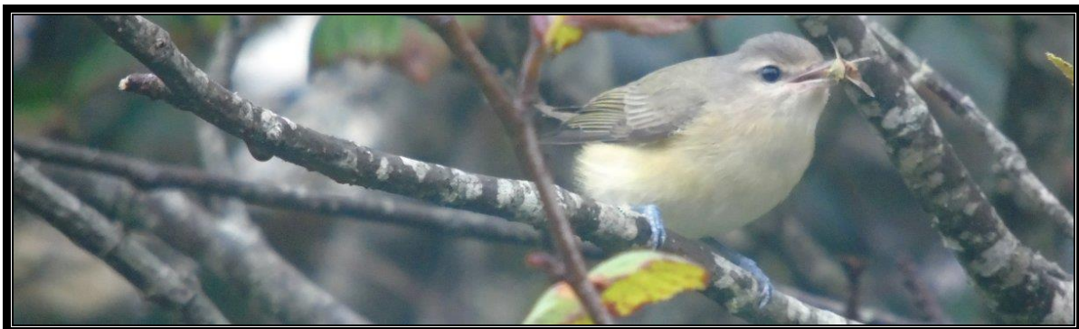
Warbling Vireo at Cape Forchu, NS on Sep. 9, 2016