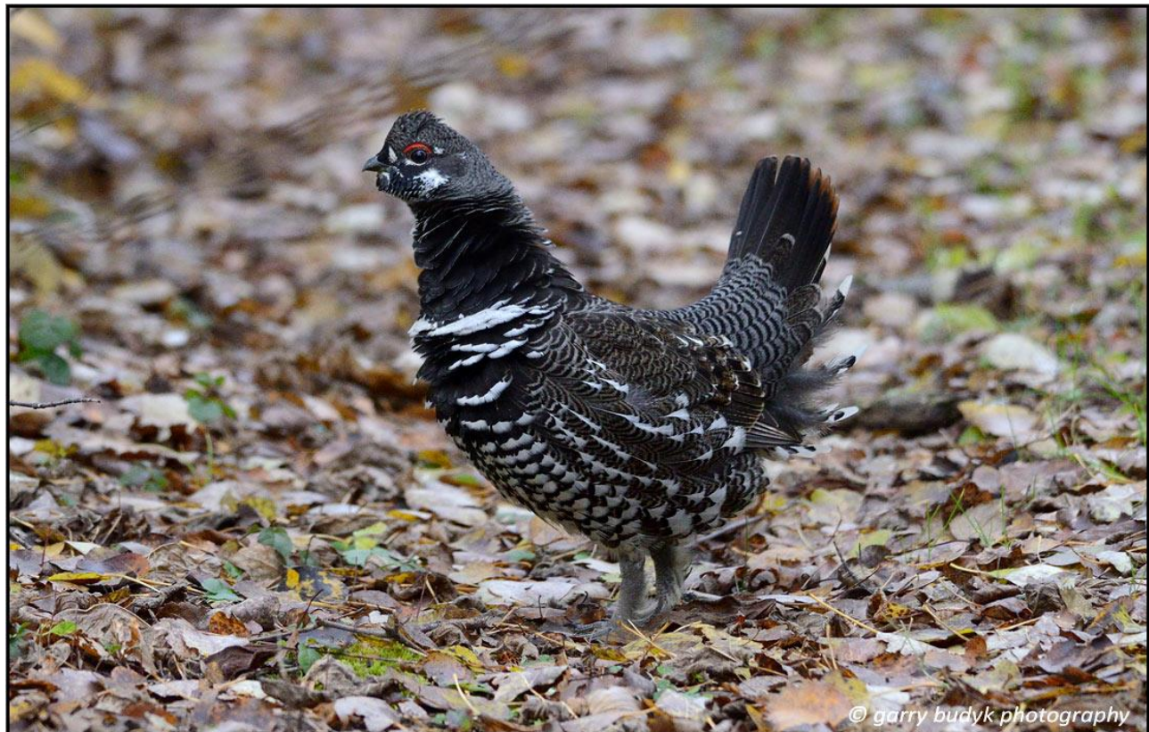
A gorgeous male Spruce Grouse at Hecla Island, Manitoba on Oct. 25, 2016