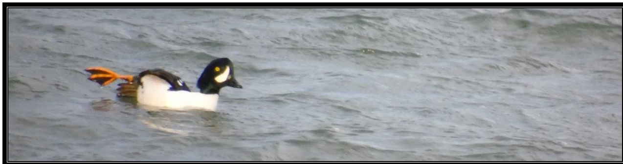
First you shake your right leg... a Barrow's Goldeneye in Yarmouth, NS on Dec. 13, 2016