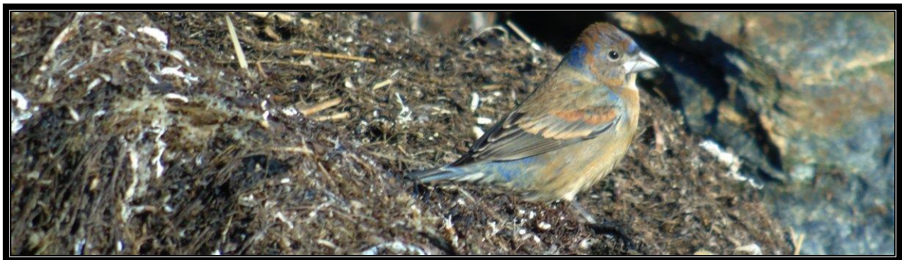
Blue Grosbeak at The Hawk, Cape Sable Island, NS on May 10, 2016