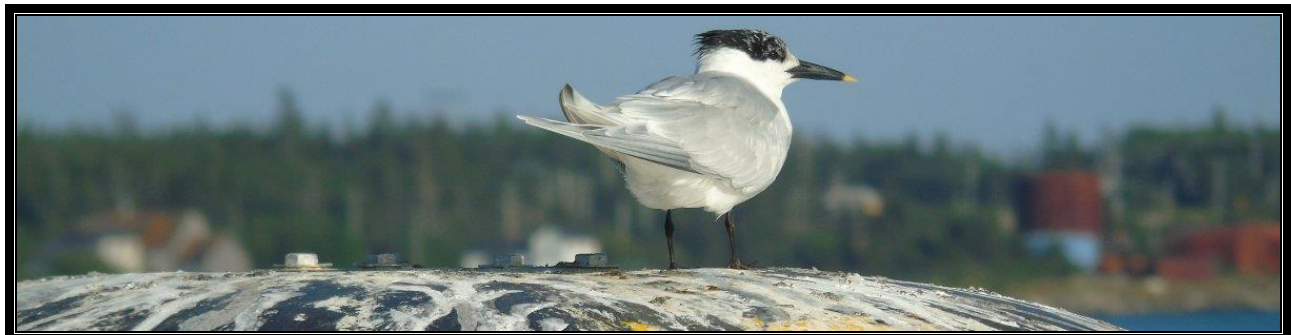
Sandwich Tern at Lower West Pubnico, NS on July 13, 2016