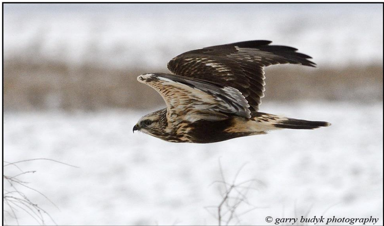
Rough-legged Hawk at Oak Hammock Marsh IBA, MB on Dec. 1, 2016