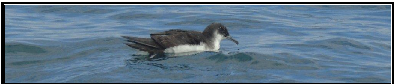
An unusually cooperative Manx Shearwater off the Pubnico Peninsula, NS on August 13, 2016