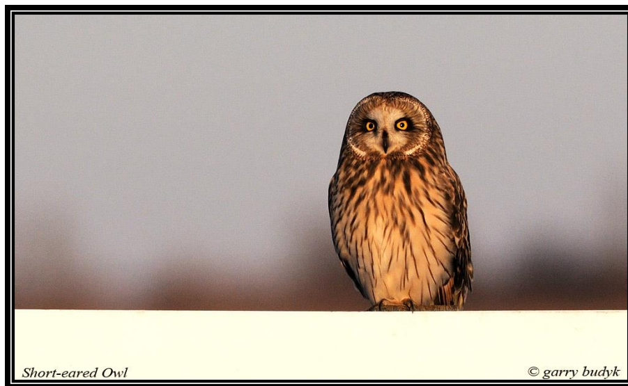
Short-eared Owl at Oak Hammock Marsh IBA, MB on Jan. 3, 2016