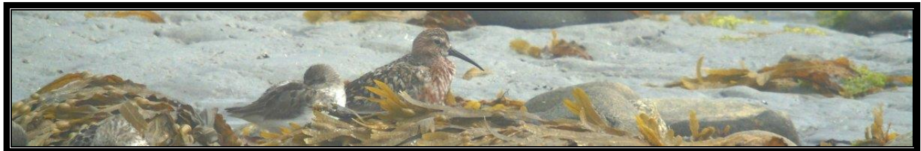
Curlew Spandpiper at The Hawk, Cape Sable Island, NS on July 23, 2016