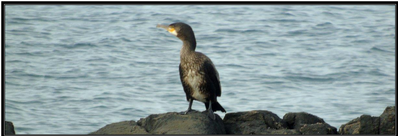
Great Cormorant at Cape Forchu, NS on September 30, 2016