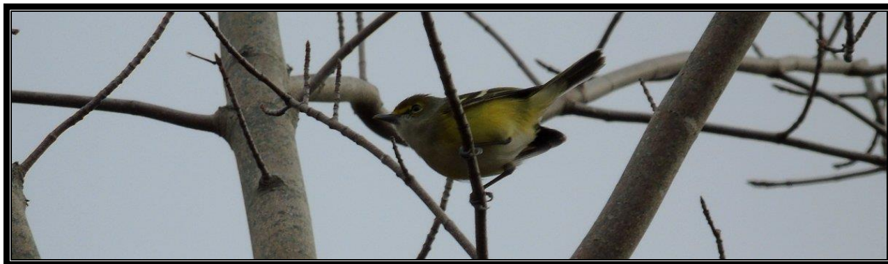
Proof that fall extends into "winter" these days – a White-eyed Vireo at Margaretsville, NS on Dec. 4, 2016