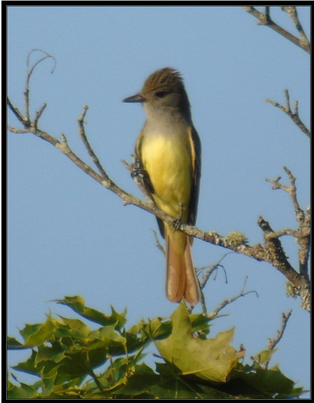
Great Crested Flycatcher at Lawrencetown, NS on June 25, 2016