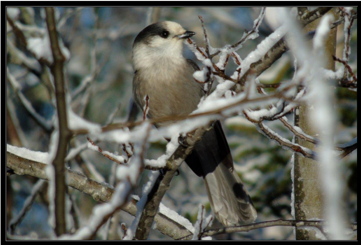
The Canadian Geographical Society has recommended the Gray Jay be made Canada's national bird. This Canada Jay (aka Gray Jay) was found south of Torbrook, NS on November 12, 2016.

This year we have 780 (+9 from last year) threshold-meeting lifelists from 123 (+3) birders. Nearly half, or 378 (+1) of these are the 14 basic Canadian, provincial or territorial lists. The number of birders reaching the Canadian and ABA thresholds is now 100 (+6) and 79 (+2) respectively. The North American category now has 37 (+1), world listers 61 (E) and world families 36 (+4). ATPAT lists dropped to 48 (-2), while Total Ticks (one of the ultimate depravities) moved to 18 (+1) listers. The provinces and territories (and their number of CLC listers), in high to low order, are ON (55), BC (50), AB (33), MB (25), QC (21), SK (19), NS (19), NB (17), YT (12), PE (9), NT (8), NL (6), and NU (4). The only change in order was NS moving ahead of NB to tie SK.