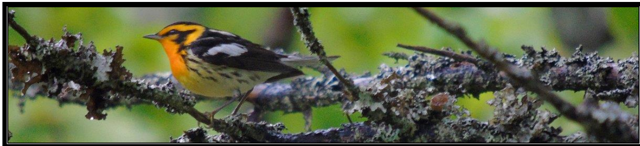
Always a pleasure to see one of these gems – Blackburnian Warbler near Inglisville, NS on June 14, 2016