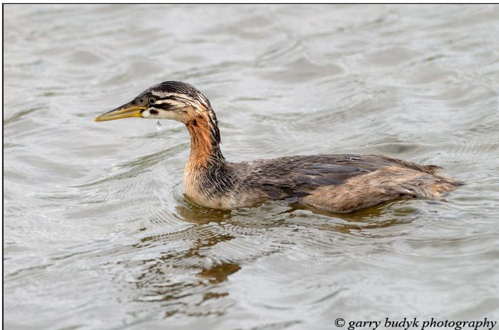
A juvenile Red-necked Grebe at Shoal Lakes IBA, MB on August 13, 2016