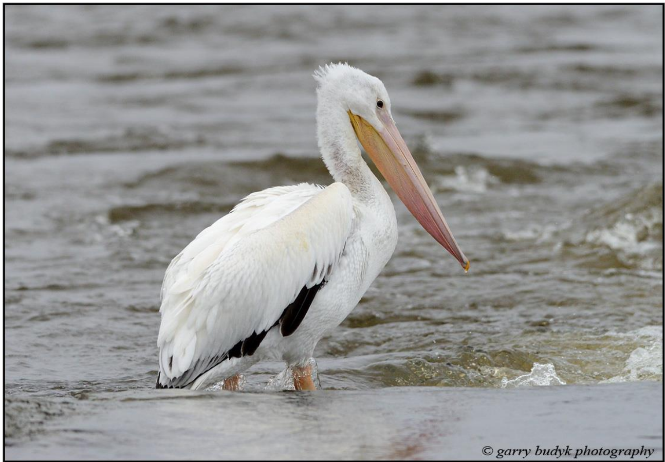
A winter lister's delight – an American White Pelican at Pine Falls Rapids, MB on Dec. 3, 2016