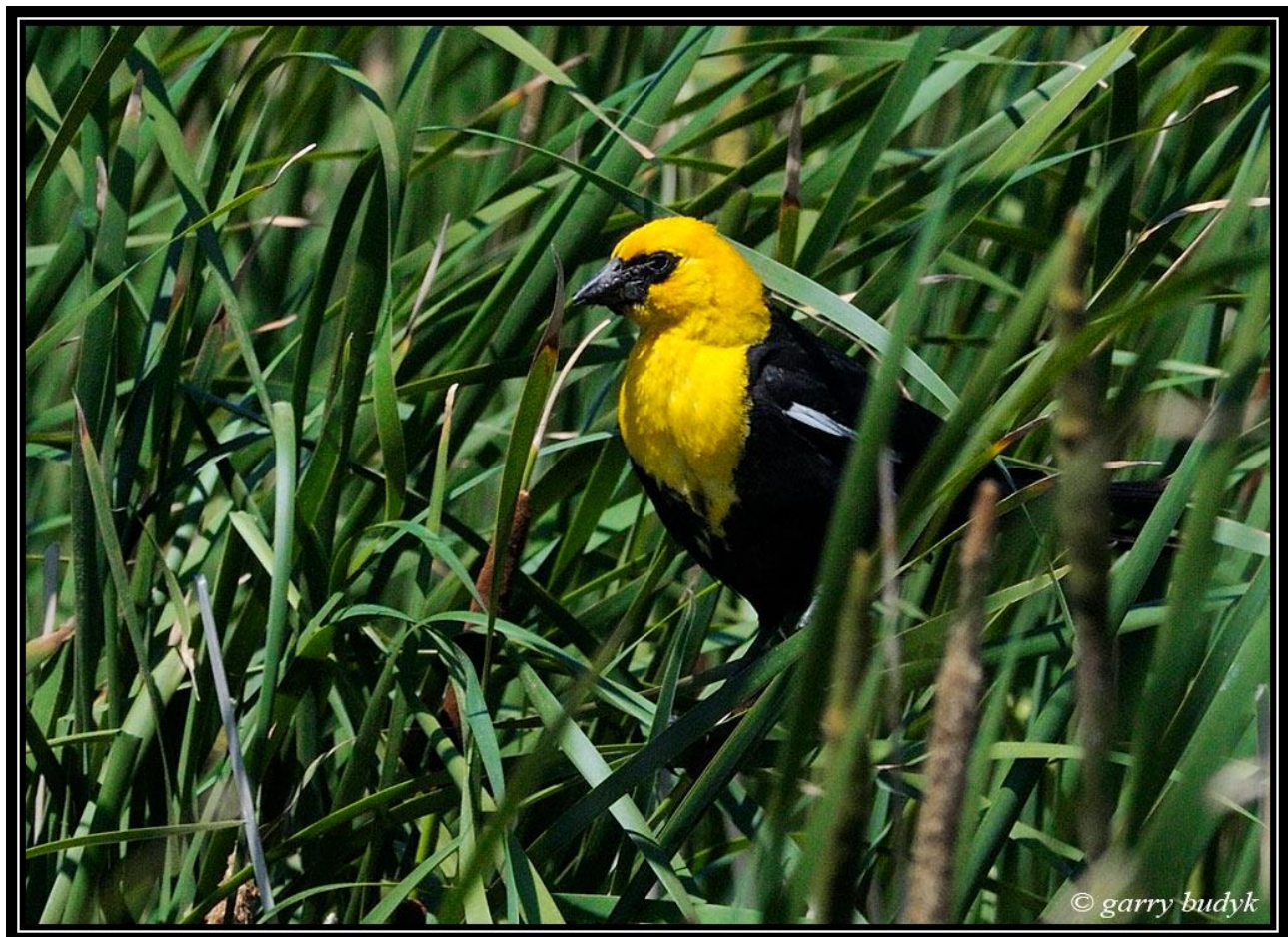
This brilliant Yellow-headed Blackbird was at Whitewater Lake IBA, MB on June 23, 2016