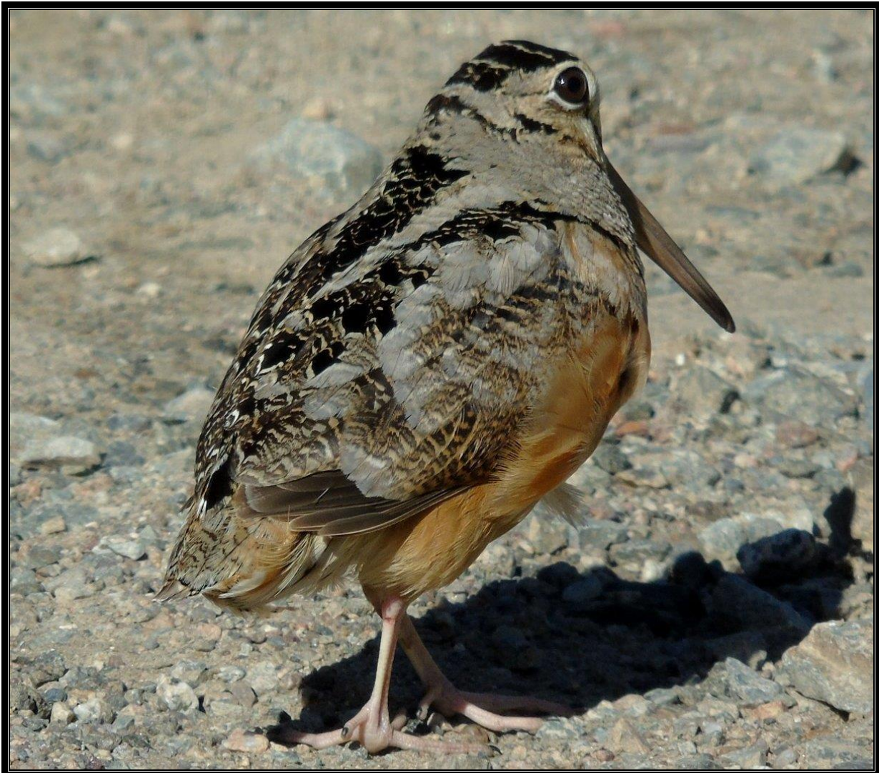
An American Woodcock out for a stroll at West Englisville, NS on June 1, 2016