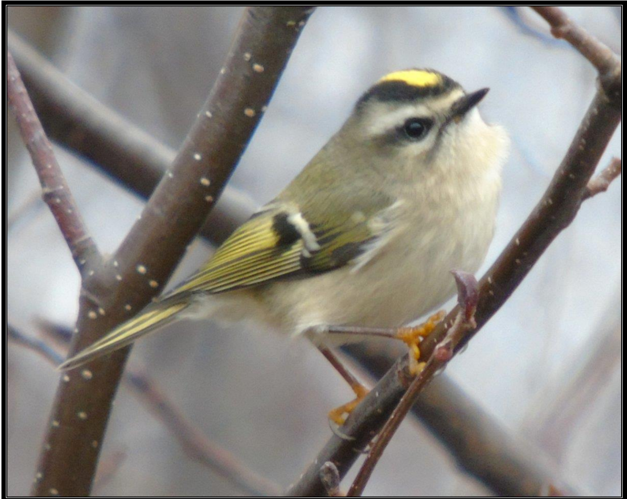
Golden-crowned Kinglet at Marshalltown, NS on Nov. 23, 2016