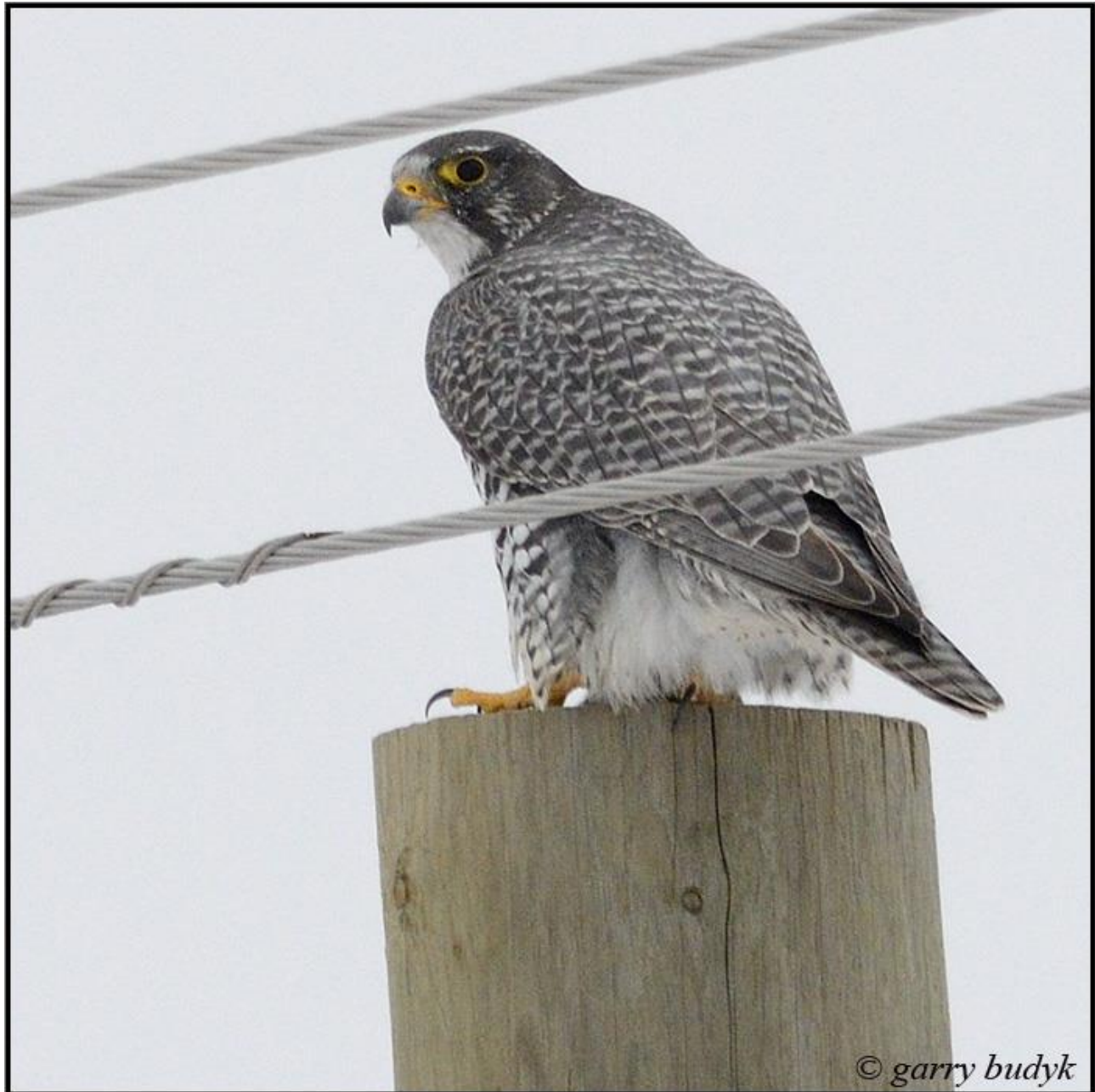
A gray morph Gyrfalcon seen near River Hills, MB on Dec. 30, 2016