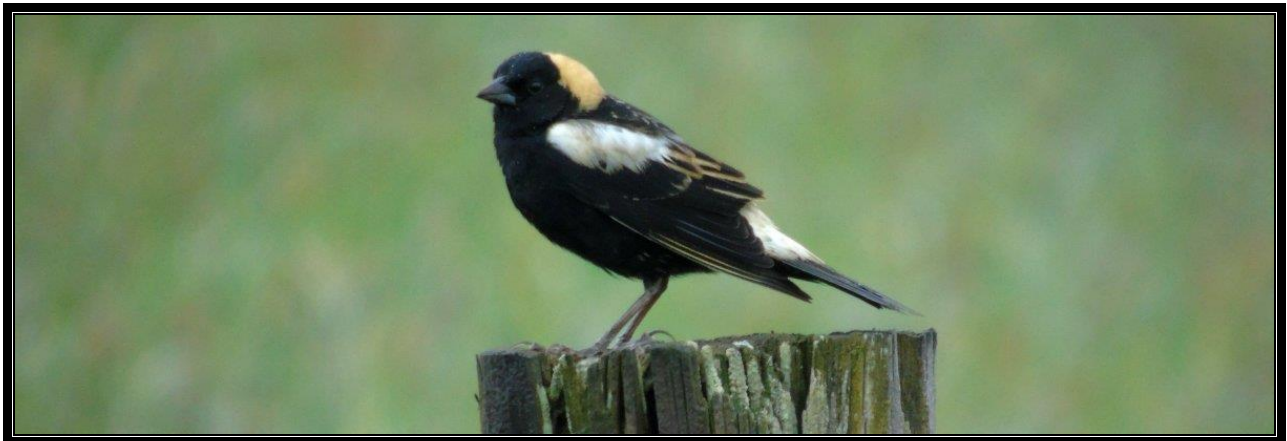
These days it is becoming far too rare a sight - a Bobolink at Torbrook Mines, NS on May 23, 2016