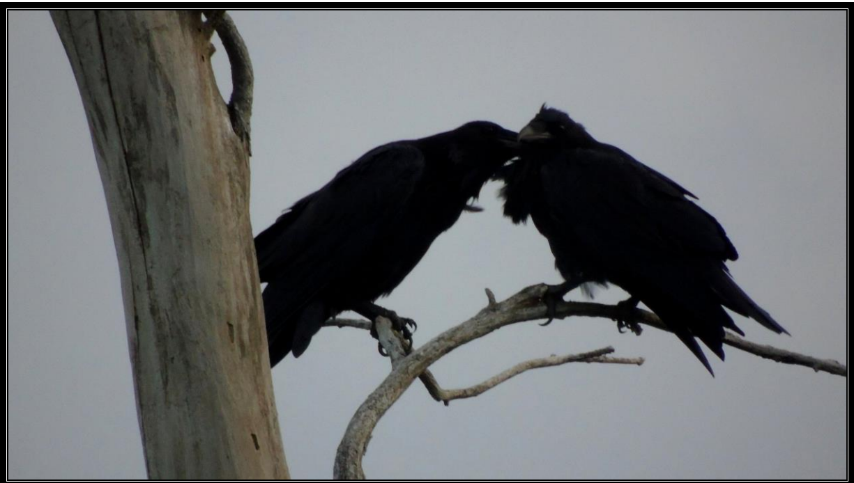
Common Ravens at East Clarence, NS on Aug. 4, 2015