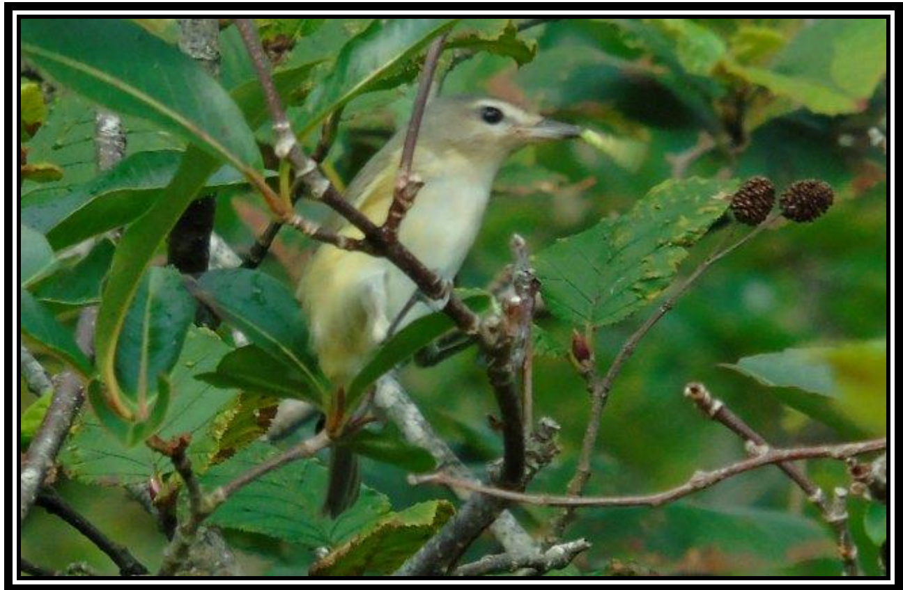
Warbling Vireo at Cape Forchu, NS on August 30, 2015

This year we have 771 (+9 from last year) threshold-meeting lifelists from 120 (-2) birders. Nearly half, or 377 (+2) of these are the 14 basic Canadian, provincial or territorial lists. The number of birders reaching the Canadian and ABA thresholds is now 94 (E) and 77 (+1) respectively. The North American category now has 36 (+2), world listers 61 (+4) and world families 32 (+1). ATPAT lists stayed at 50, while Total Ticks (one of the ultimate depravities) stayed at 17 listers. The provinces and territories (and their number of CLC listers), in high to low order, are ON (57), BC (47), AB (36), MB (25), QC (22), SK (21), NB (18), NS (17), YT (12), PE (9), NT (8), NL (6), and NU (5).