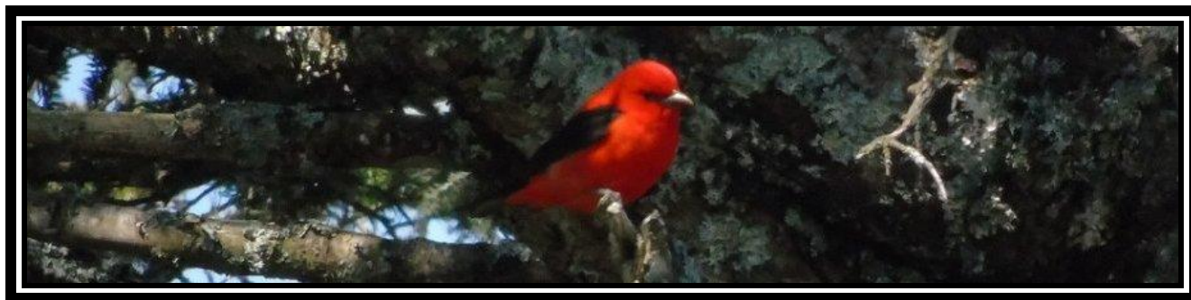
Some birds stand out more than others – Scarlet Tanager at Pubnico Point, NS on May 16, 2015