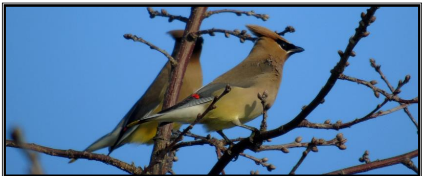
Cedar Waxwings at Annapolis Royal, NS on August 5, 2015