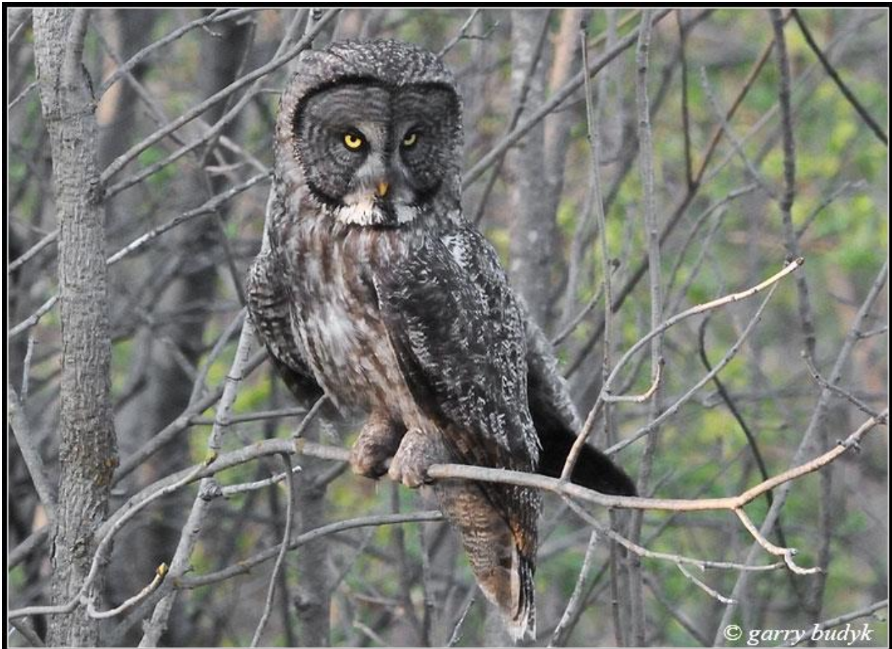
Manitoba's iconic Great Gray Owl – photographed by Garry Budyk at Bird River, MB on May 26, 2015