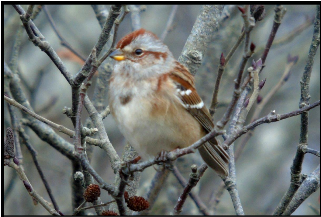
American Tree Sparrow at Yarmouth, NS on December 10, 2015