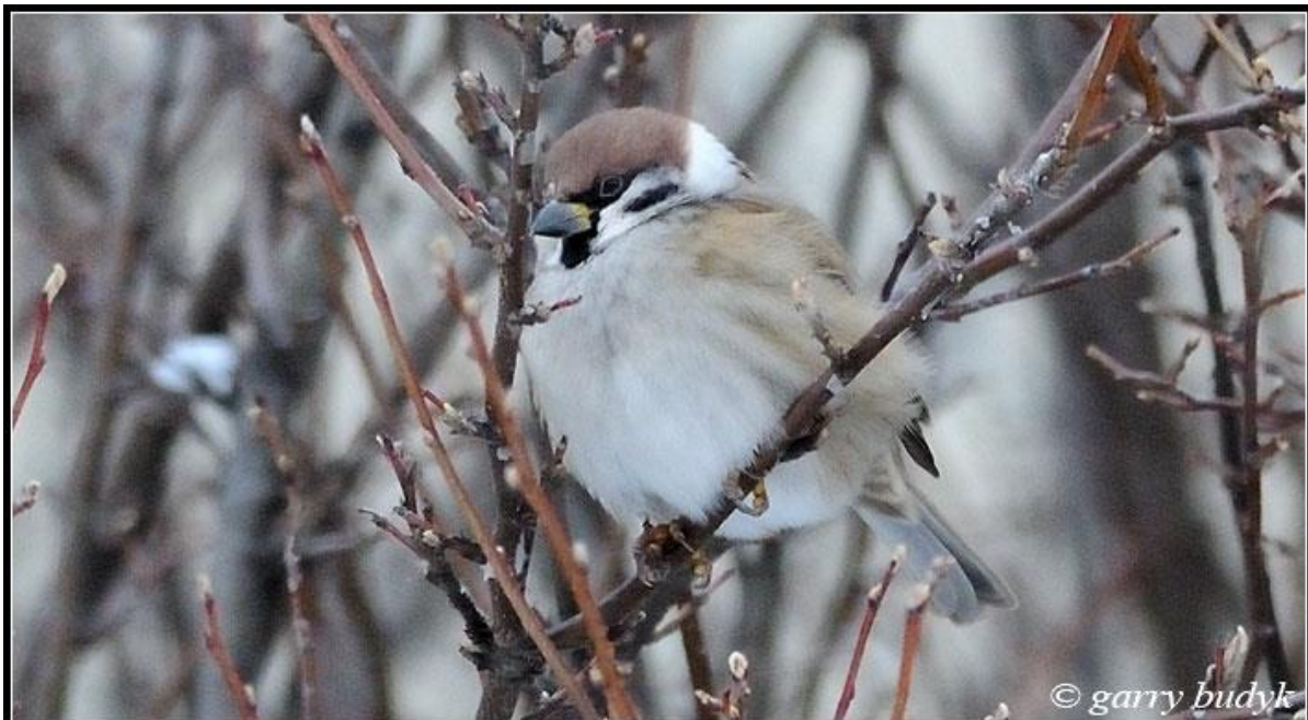
Eurasian Tree Sparrow on the Winnipeg, MB CBC on December 20, 2015