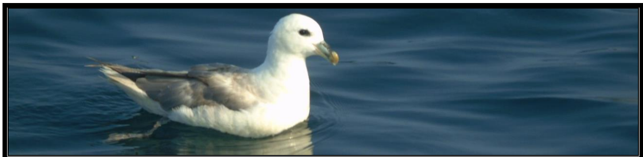
Northern Fulmar off Lower West Pubnico, NS on August 29, 2015