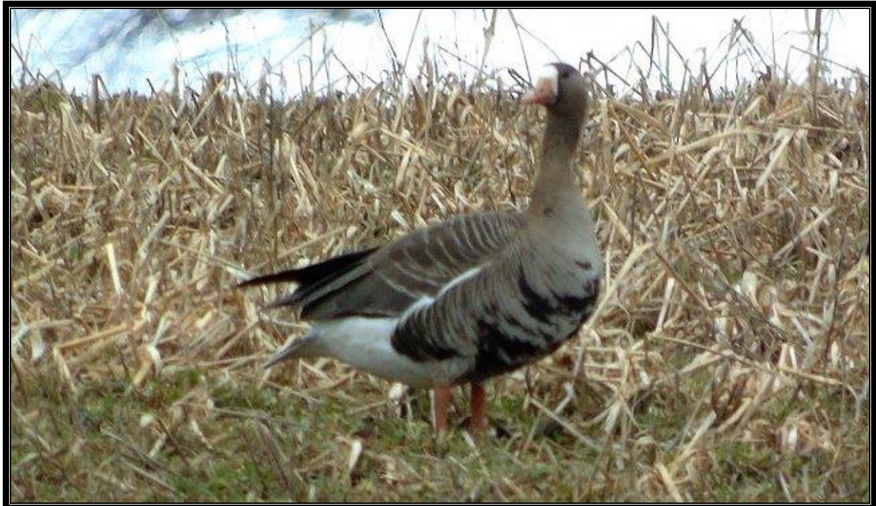
Greater White-fronted Goose at Canning, NS on April 25, 2015

71 14/15 Jolande St-Pierre, Alderwood NB