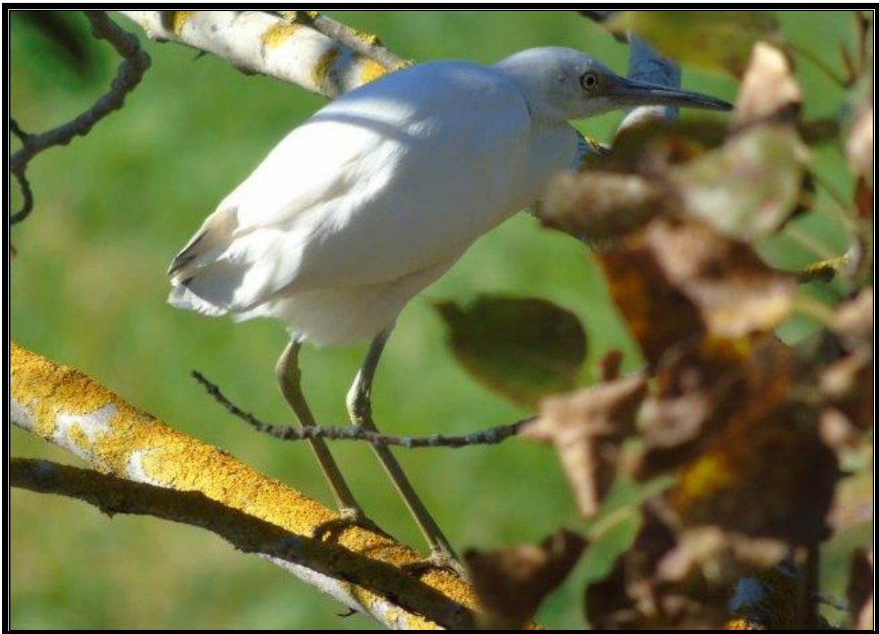
Little Blue Heron at Canning, NS on Sep. 28, 2015