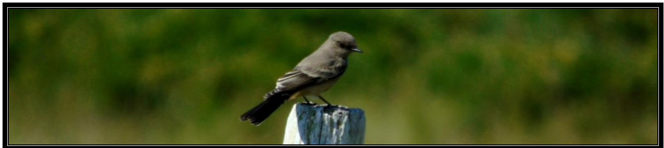
Say's Phoebe at The Hawk, Cape Sable Island, NS on Sep. 6, 2015