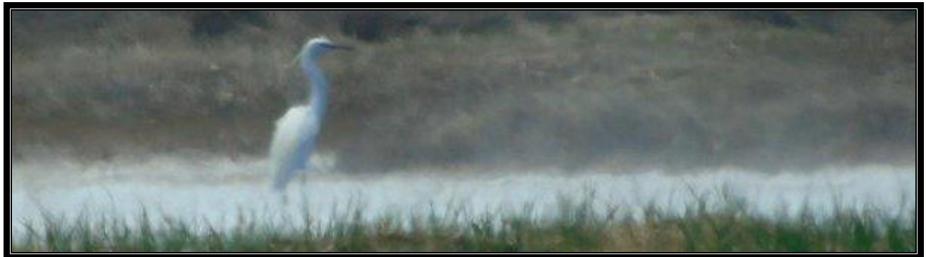
A distant Little Egret at Daniel's Head, Cape Sable Island, NS on May 16, 2015