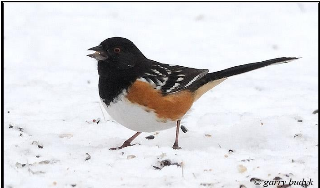
Spotted Towhee at Warren, Manitoba on December 7, 2015