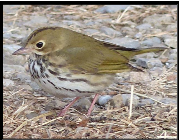
Two winter warblers: a Cape May (on the left) on January 10, 2015 at a feeder in Markham RM - ; and an Ovenbird (on the right) in December 2015 at Nanton, Alberta