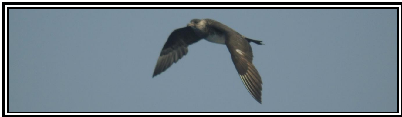
Pomarine Jaeger off Lower West Pubnico, NS on August 29, 2015