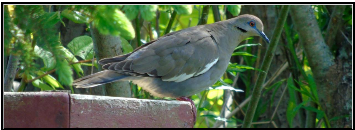
White-winged Dove at Johnny Nickerson's feeder at Lower Clarks Harbour, NS on June 15, 2015