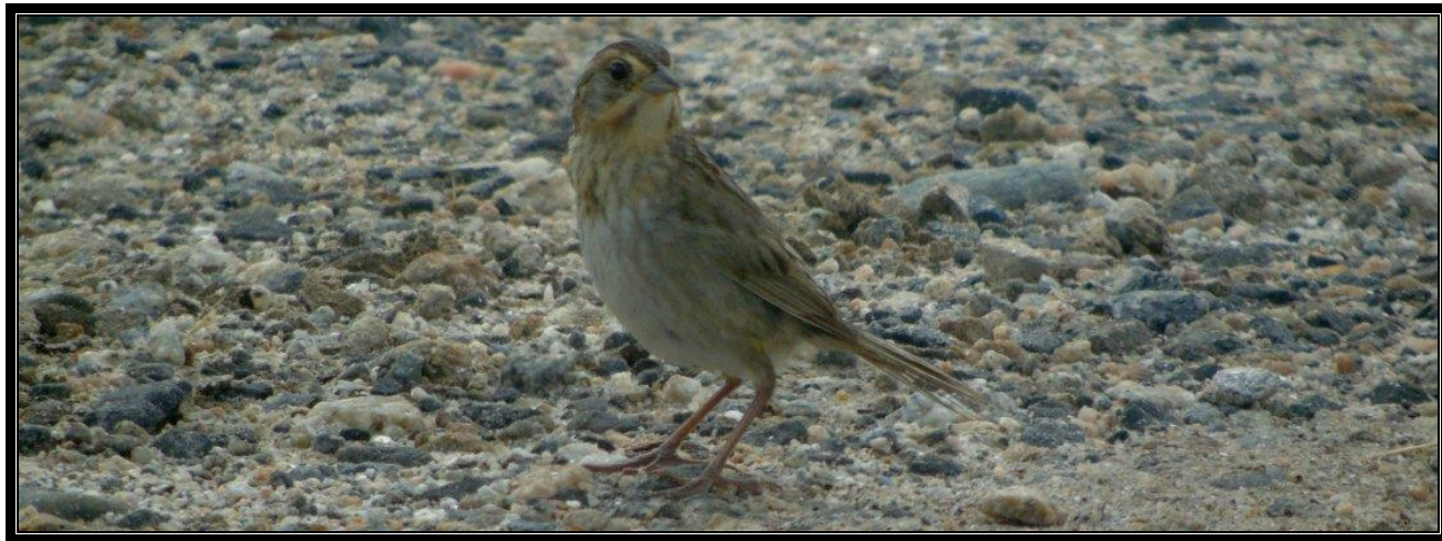
Nelson's Sparrow at Baccaro Point, NS on August 11, 2015