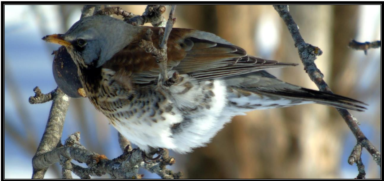
Fieldfare at East Apple River, NS on February 8, 2015

205 43% Clarence Stevens, Sr., Dartmouth NS (+1)