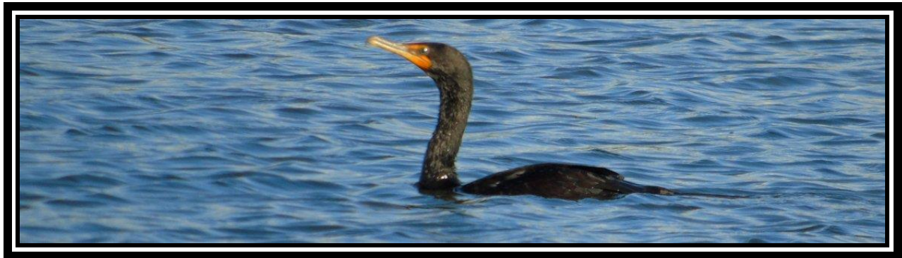
Double-crested Cormorant at Annapolis Royal, NS on August 5, 2015