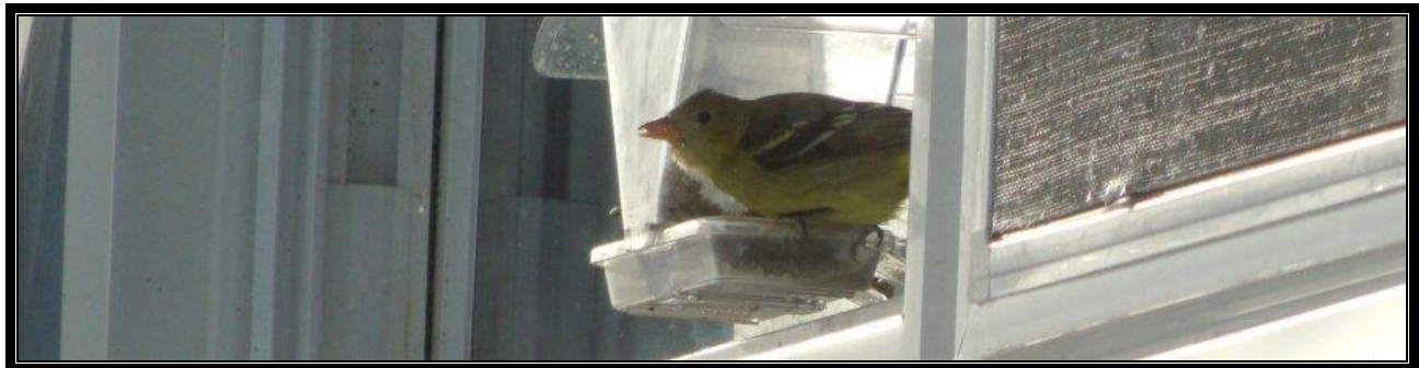
Western Tanager at Middleton, NS on January 13, 2015