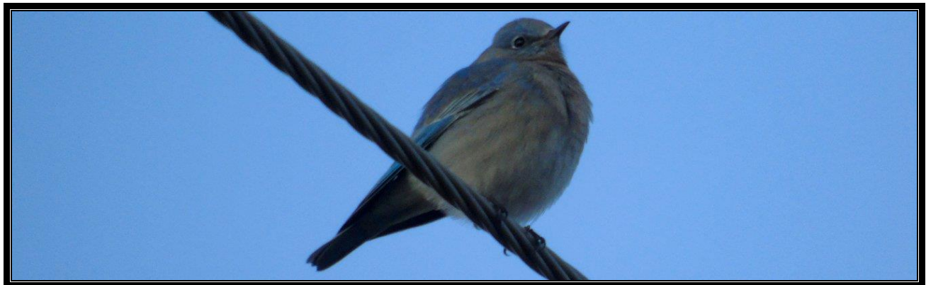
Part of a contingent of Mountain Bluebirds that visited NS last fall and winter – this one at Mavilette Beach on Dec. 1, 2015