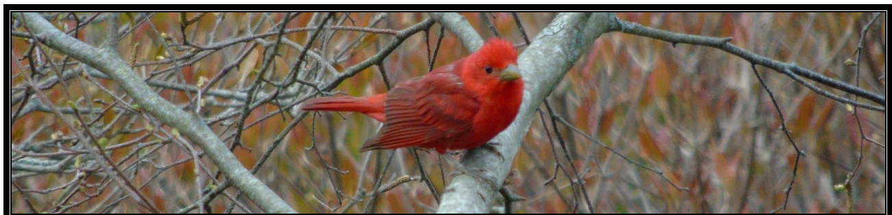
Summer Tanager at Bear Point, NS on May 25, 2015