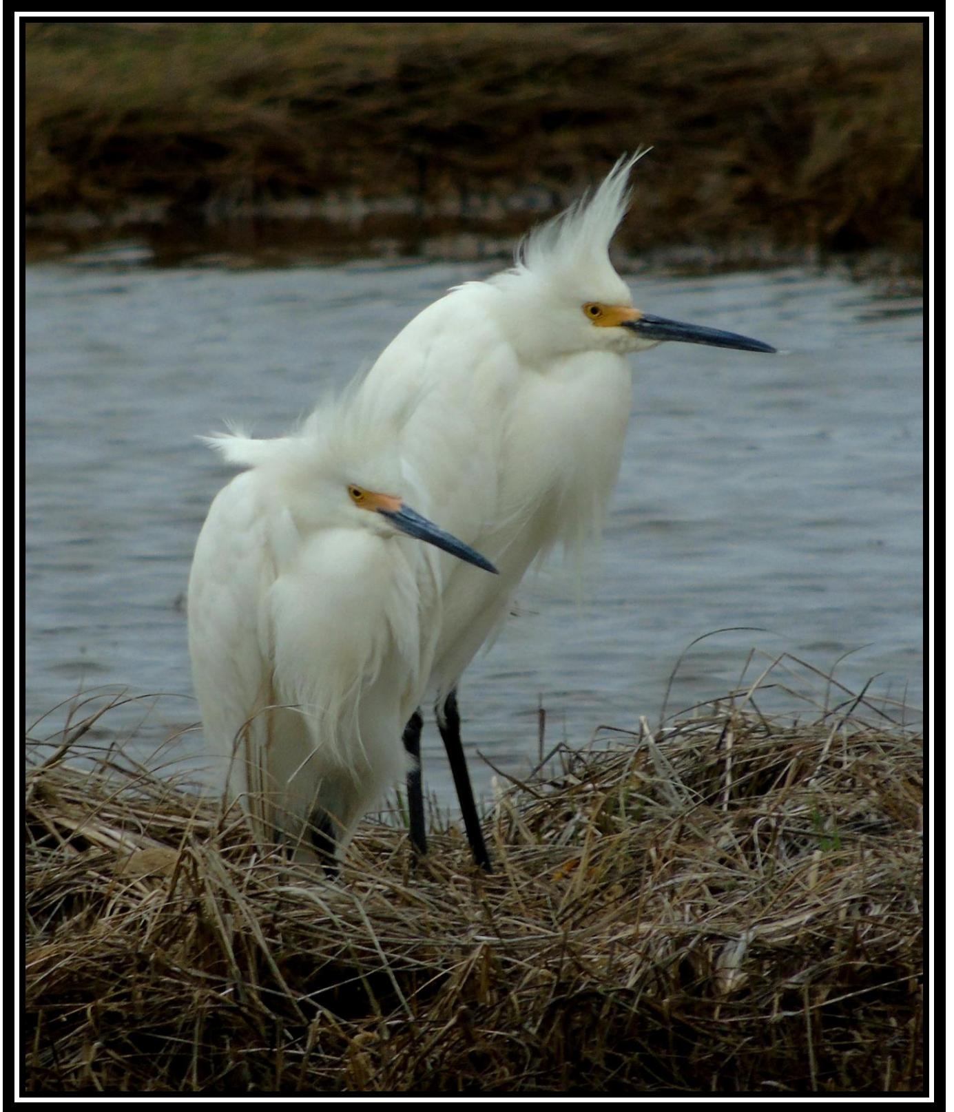
Two windblown Snowy Egrets at Overton, Yarmouth County, NS on May 19, 2015