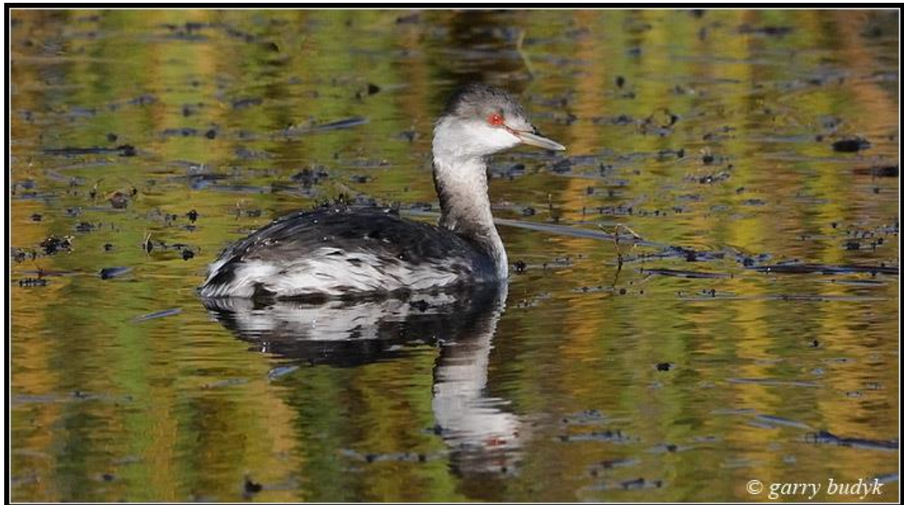
Horned Grebe at West Shoal Lake, Manitoba on October 3, 2015 – photograph by Garry Budyk