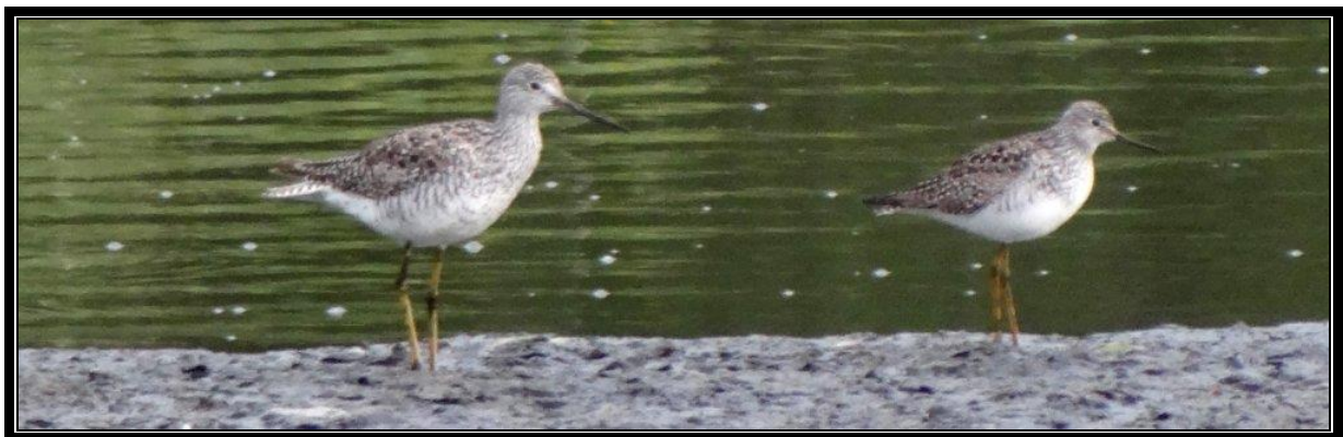
Greater and Lesser Yellowlegs posing together for comparison at the Iona Island Sewage Lagoons, BC on May 13, 2013