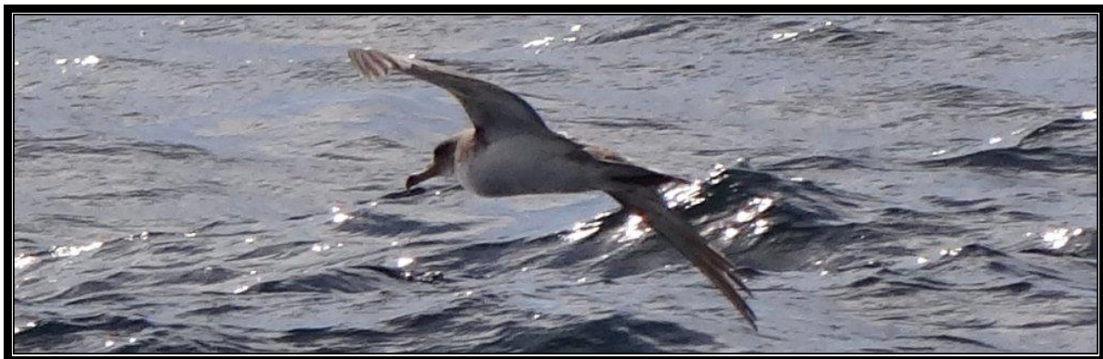
Cory's Shearwater on NSBS pelagic trip off Sambro, NS on September 21, 2013