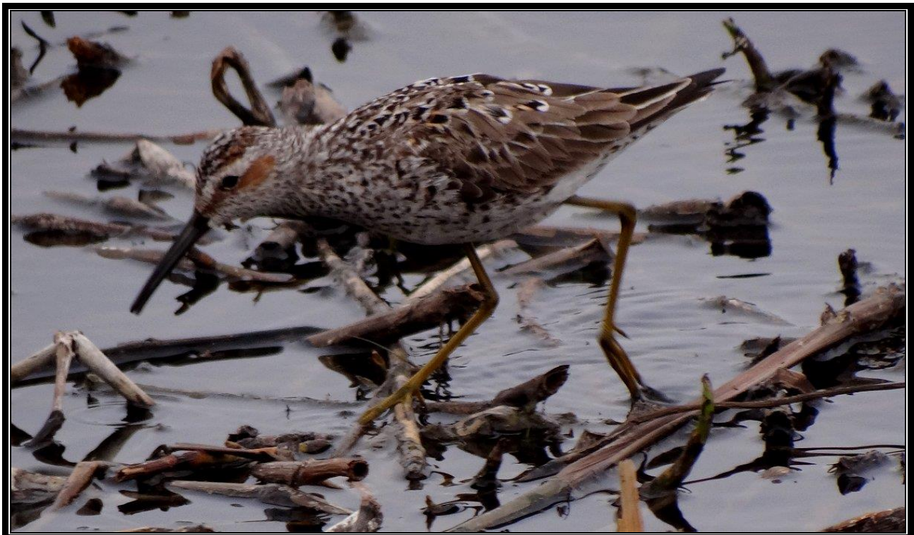
Stilt Sandpiper at Chaplain Lake, SK on May 17, 2013