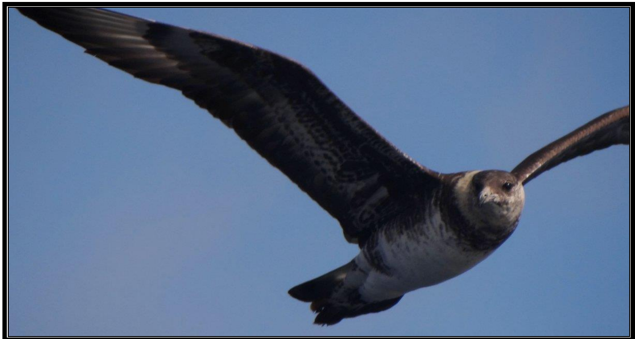
Pomarine Jaeger on NSBS pelagic trip off Sambro, NS on September 21, 2013