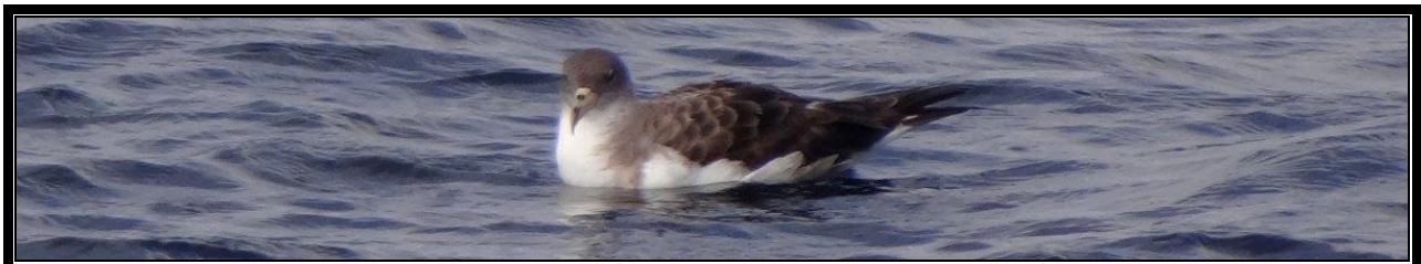
Cory's Shearwater on NSBS pelagic trip off Sambro, NS on September 21, 2013