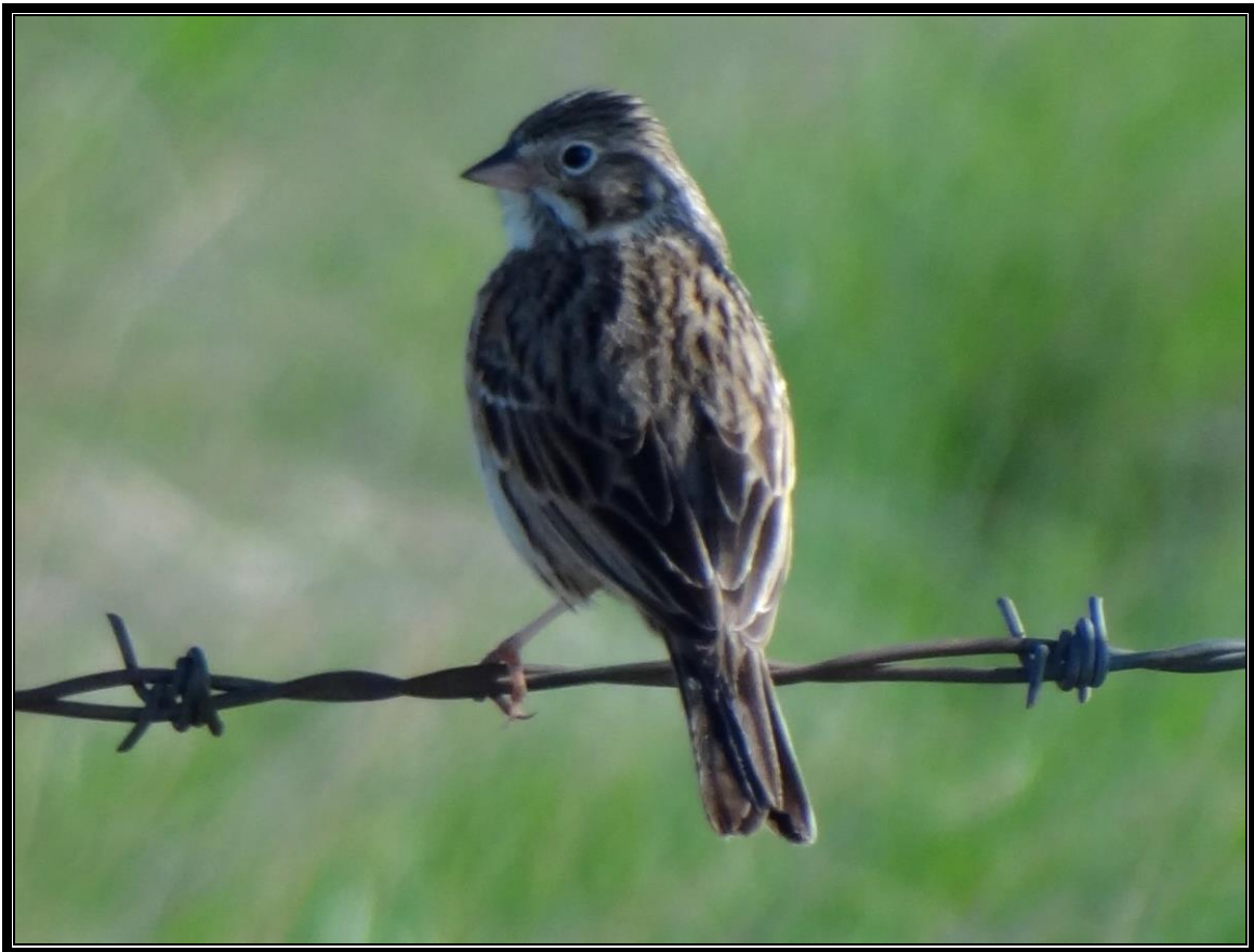
Vesper Sparrow along Township Road 150 on the south perimeter of the Suffield Range, AB on May 17, 2013