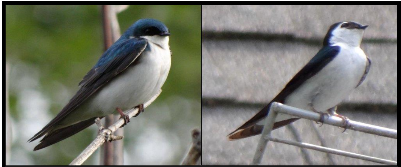
Tree Swallow at Iona Island, BC on May 13, 2013 and Violet-green Swallow at Goldstream Provincial Park, BC on May 10, 2013

95 Clarence Stevens, Sr., Dartmouth NS (new)