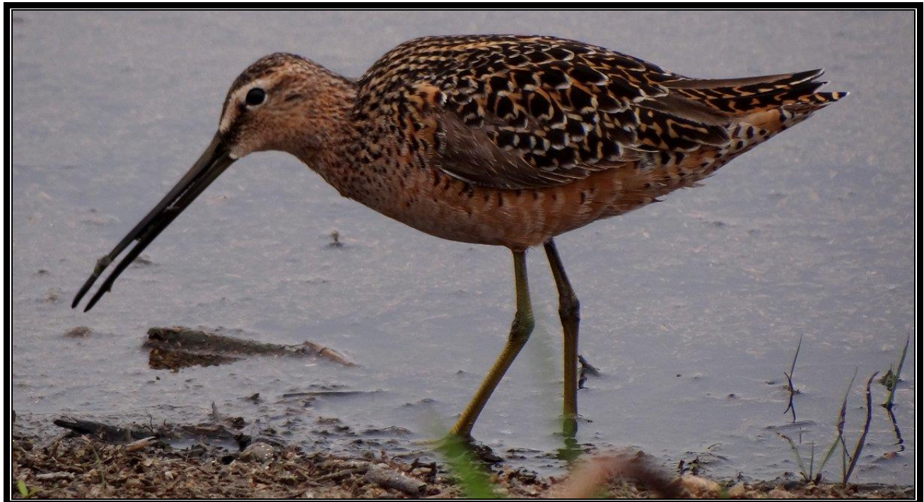
Long-billed Dowitcher west of Midale, SK on May 18, 2013