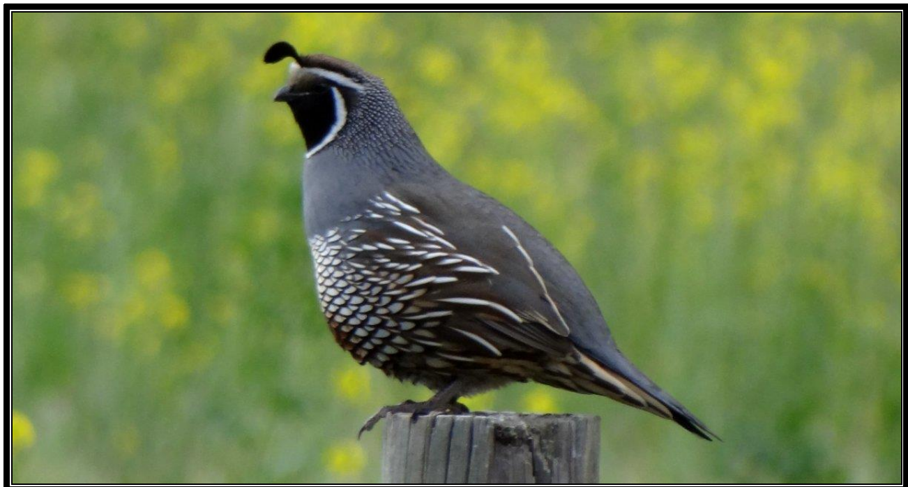
California Quail west of Keremeos, BC on May 13, 2013

We had not expected to exceed our target of 170 species with the weather we had so we were very pleased to finish our day with 177 species. Raptors really lead the count with 9 hawk and 5 owl species. We covered 397 km by car and about 10 km by foot, a modest amount of travel for a Big Day that undoubtedly added to our enjoyment of the day. Thanks to all of you who sponsored us in this endeavour and thanks to OFO for asking us to take on this challenge. We had a lot of fun and are looking forward to our next Big Day experience. -- included here thanks to kind permission of Frank Pinilla