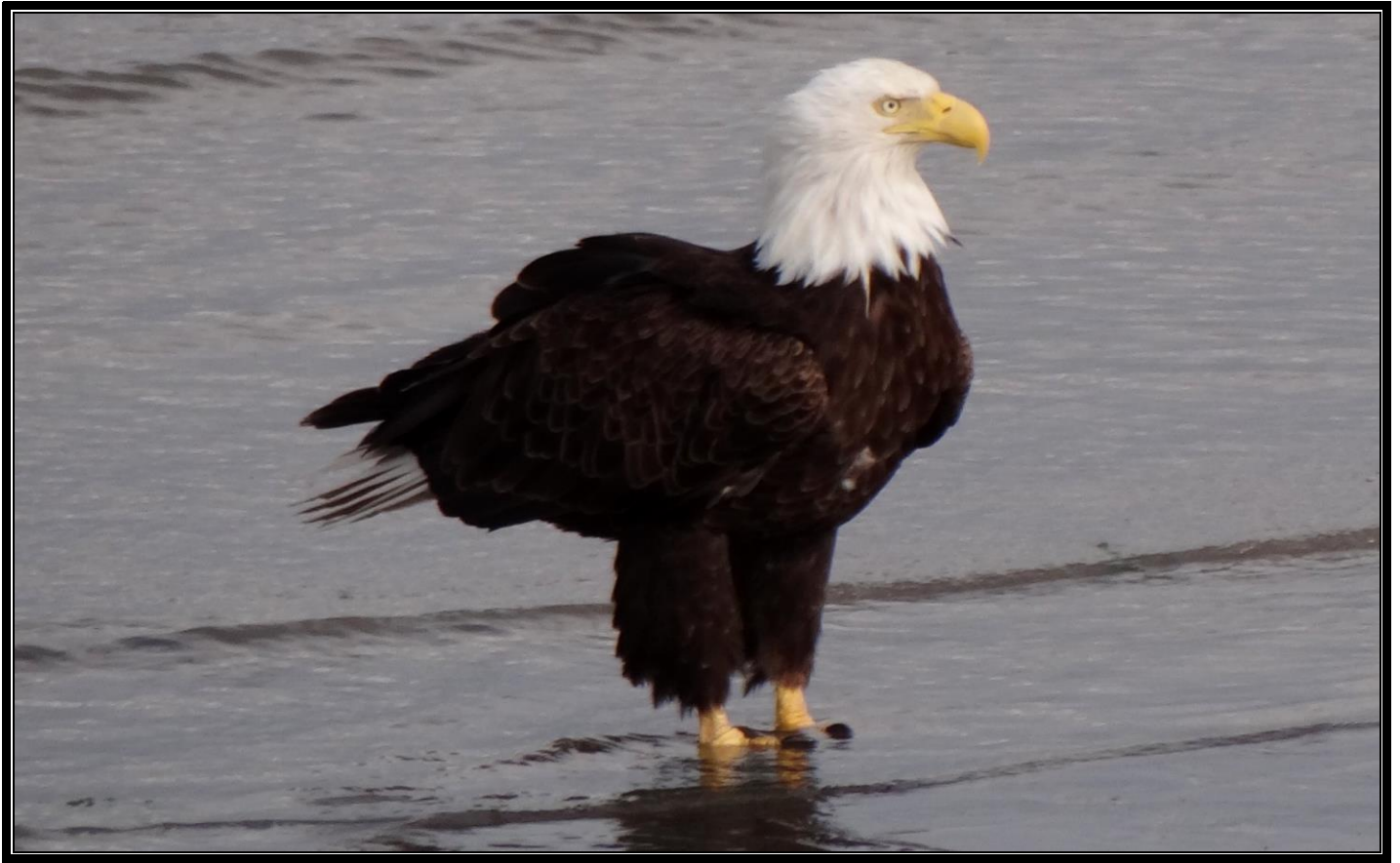
Bald Eagle on the Iona Island Jetty, BC on May 13, 2013