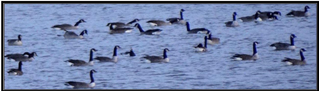
Barnacle Goose in the midst of Canada Geese in quarry north of Truro, NS on December 8, 2013