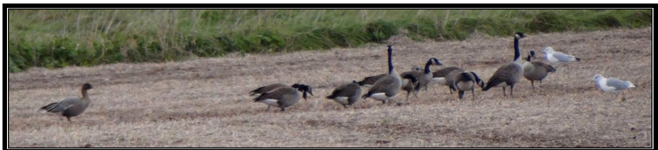
Pink-footed Goose (on the left – following some Canada Geese) at Truro, NS on October 26, 2013