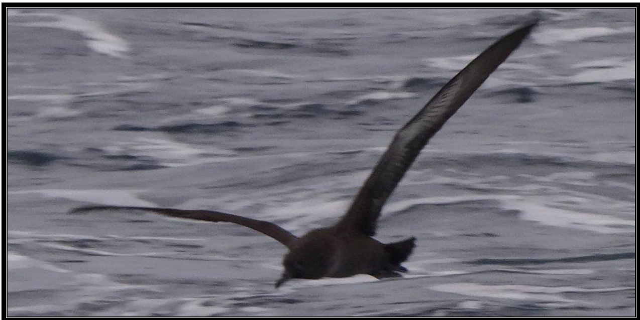
Sooty Shearwater off Sambro, NS on September 21, 2013