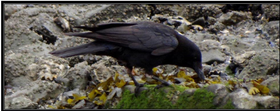
Northwestern Crow on the jetty at Iona Island, BC on May 13, 2013