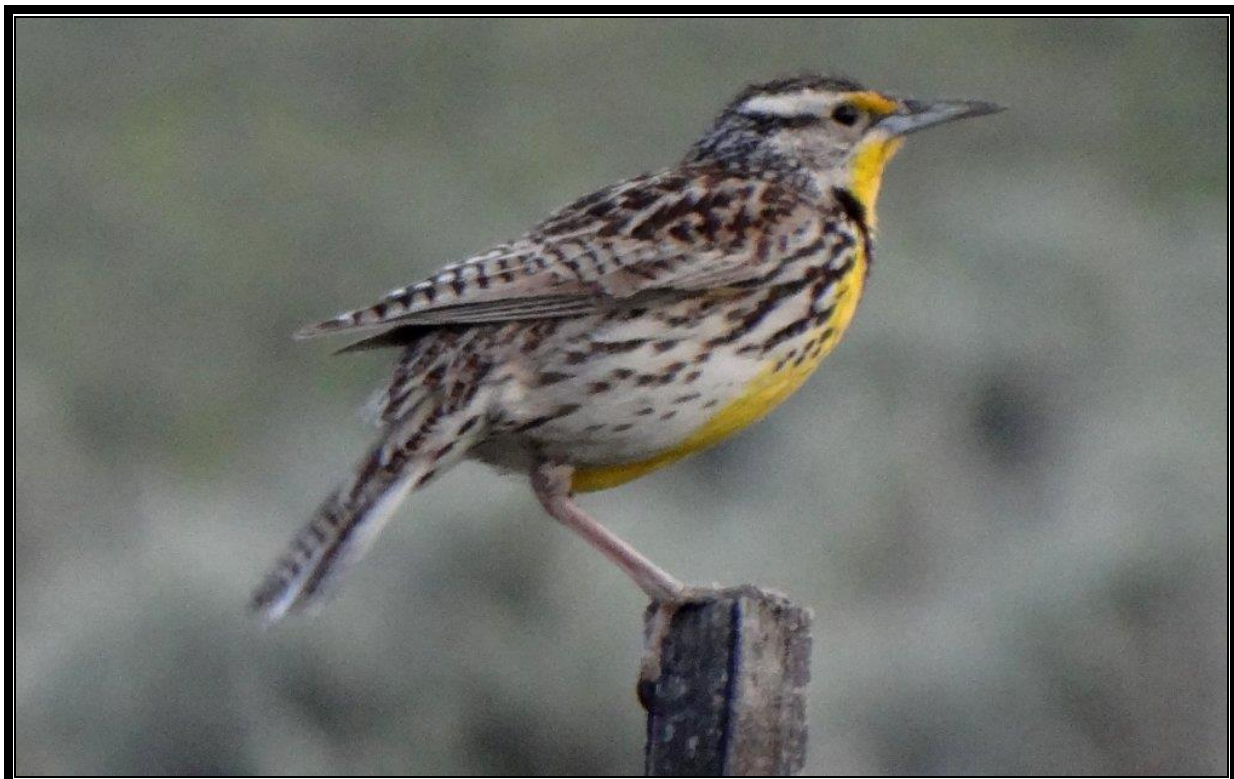
Western Meadowlark on Nighthawk Road, west of Osoyoos, BC on May 14, 2013