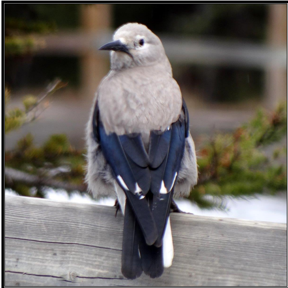
Clark's Nutcracker Lake Louise, AB May 16, 2013