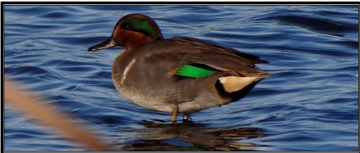
Green-winged Teal at Annapolis Royal, NS on October 29, 2013