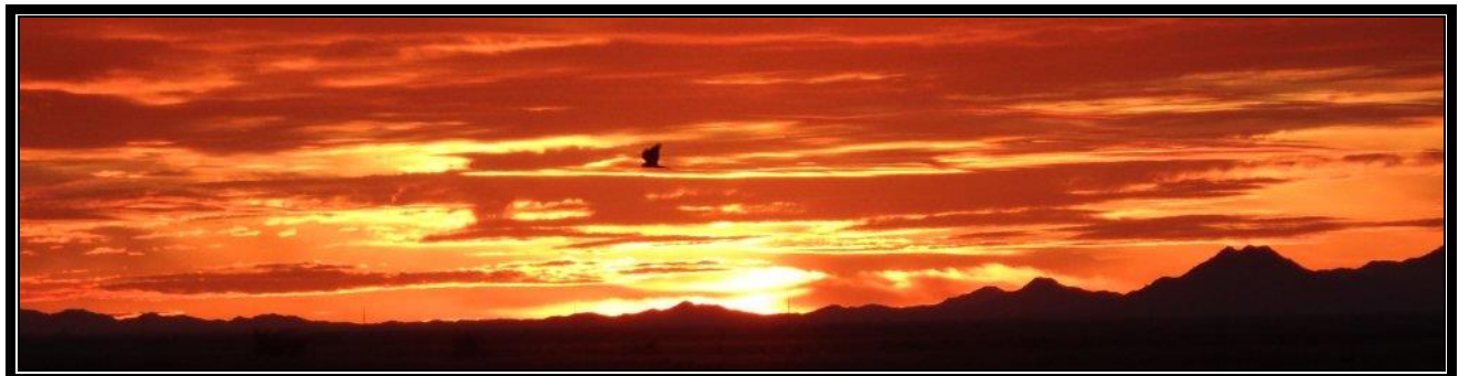
Sunset southwest of Coolidge, AZ on February 3, 2013