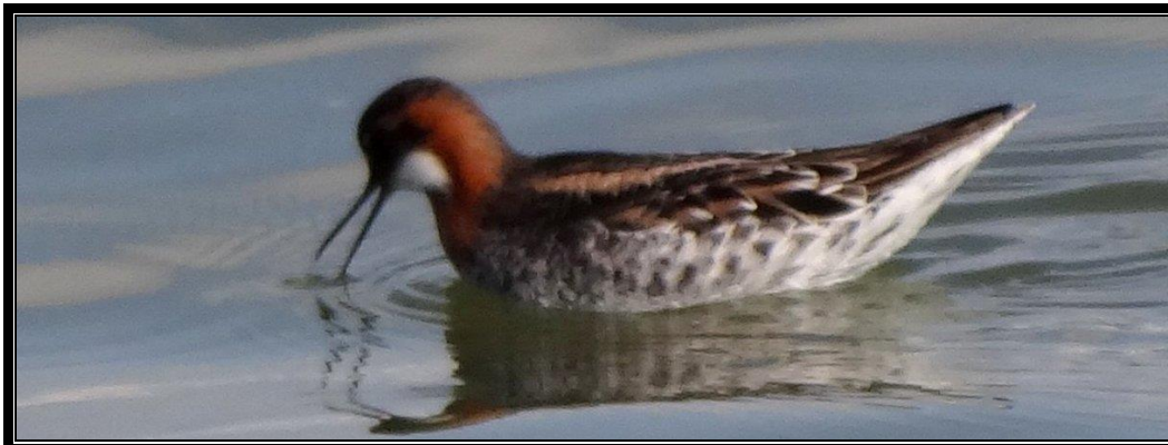
Red-necked Phalarope at Chaplain Lake, SK on May 17, 2013