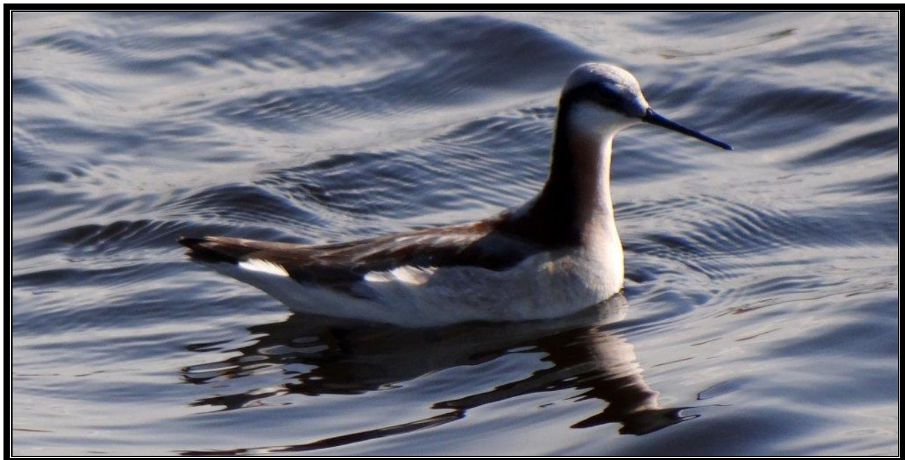
Wilson's Phalarope at Chaplain Lake, SK on May 17, 2013