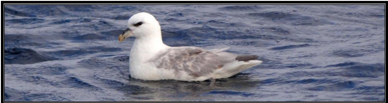
Northern Fulmar off Sambro, NS on Sep. 21, 2013