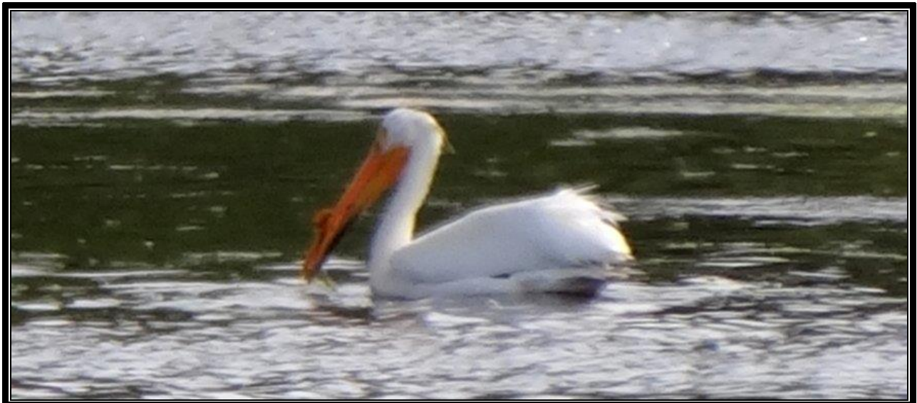
American White Pelican in Upper South Cove at First South, NS on Jun. 10, 2013