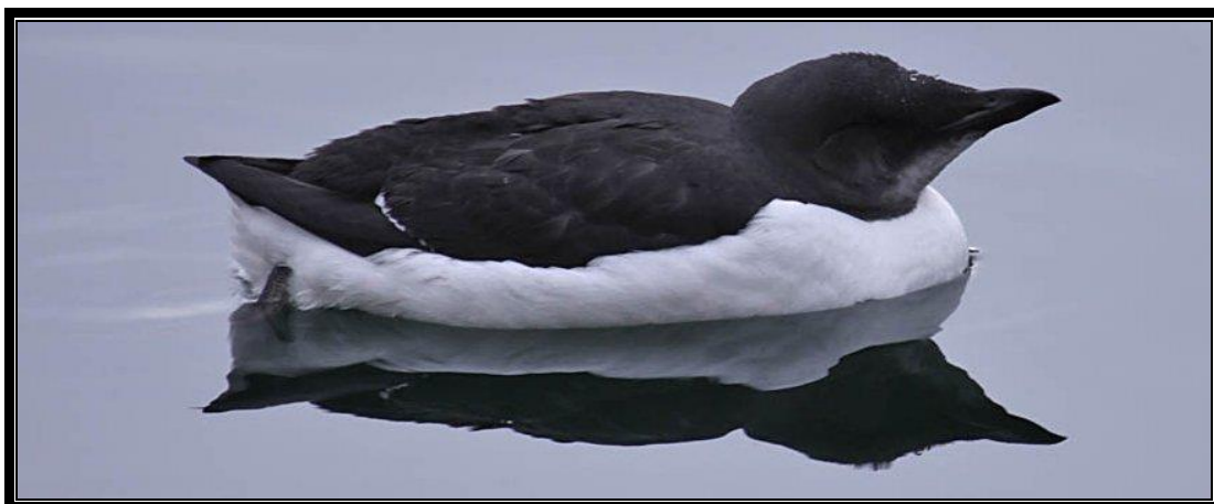
Thick-billed Murre at Kingston, ON on December 4, 2013