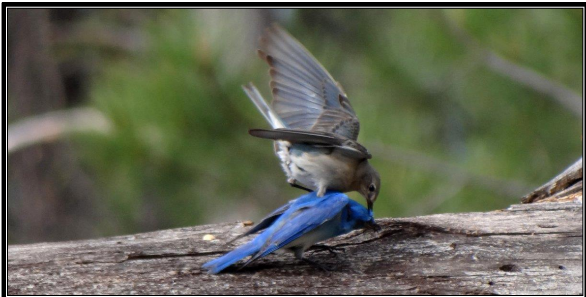
A pair of Mountain Bluebirds (female hen-pecking male) west of Oliver, BC on May 15, 2013