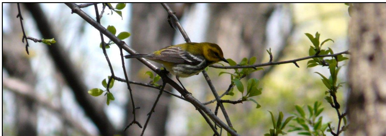
Black-throated Green Warbler at Ottawa, ON on May 11, 2011