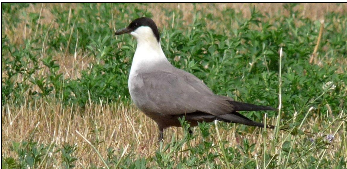
Long-tailed Jaeger at the Tatlayoko Bird Observatory, BC taken by Avery Bartels on Aug. 22, 2011