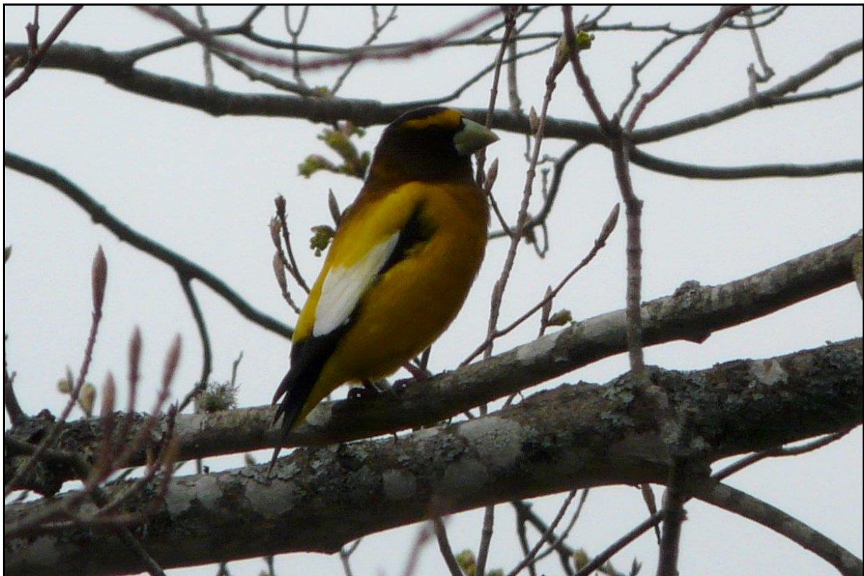
Evening Grosbeak in Tremont, NS on Apr. 30, 2011