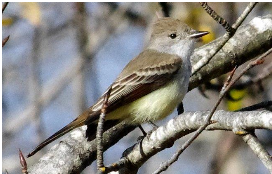
Ash-throated Flycatcher at Revelstoke, BC on Nov. 1, 2011