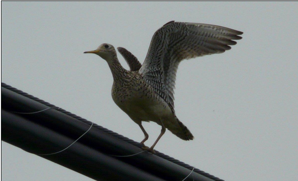
Upland Sandpiper along the Dunrobin Road, southeast of Dunrobin, ON on June 4, 2011 (Jeremy Kimm may remember this bird)