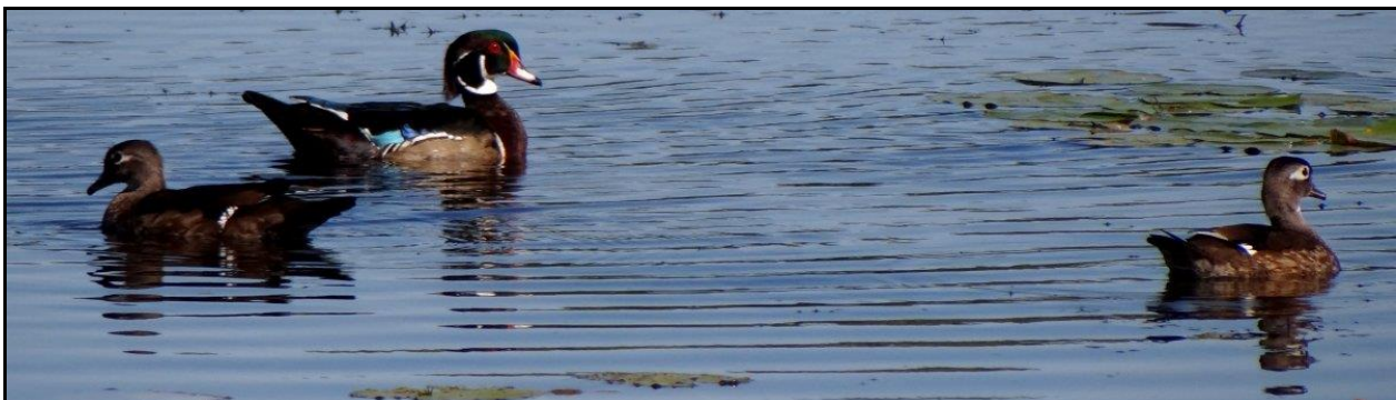
Wood Ducks at the Britannia Conservation Area, Ottawa, ON on Sep. 18, 2011