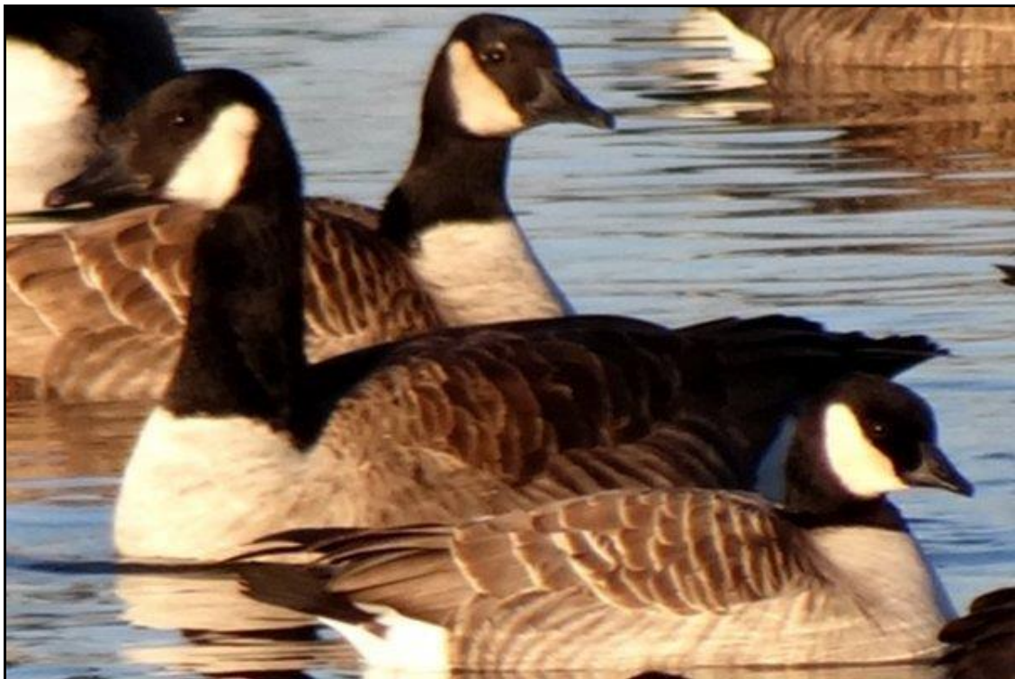
Cackling Goose (lower right) with Canada Geese at Ottawa, ON on Dec. 4, 2011