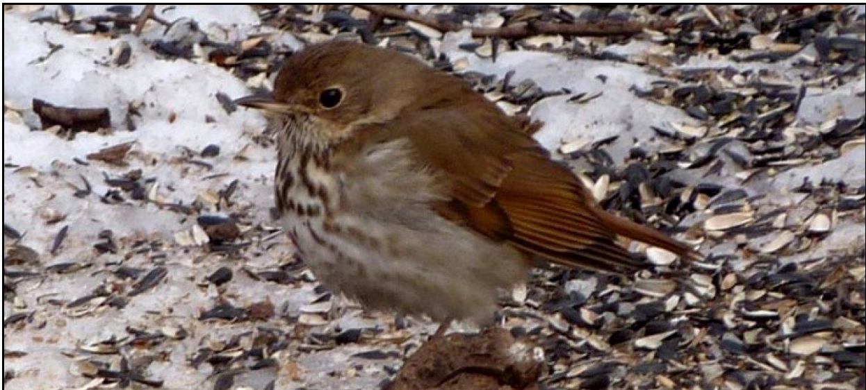
Hermit Thrush wintering in Ottawa, ON