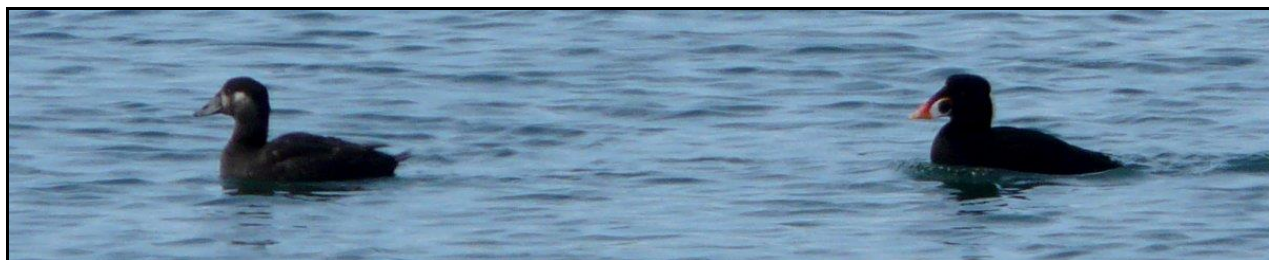
Surf Scoters (female left, male right) at Meteghan, NS on Apr. 25, 2011