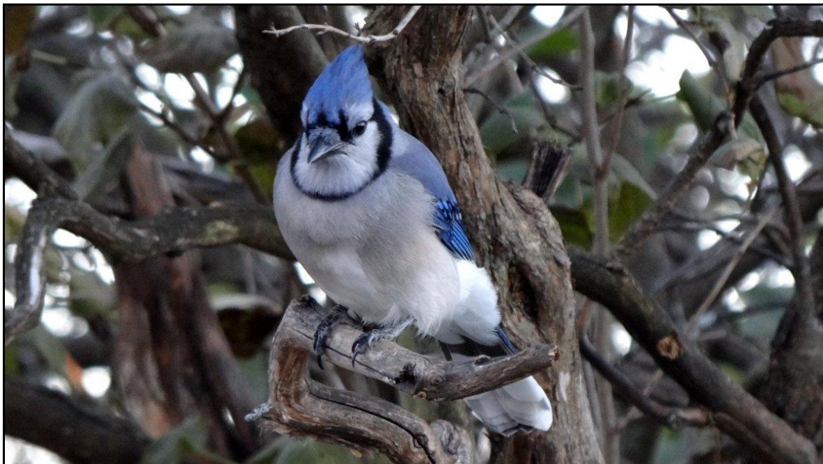
Blue Jay at Shirleys Bay, west of Ottawa, ON on Nov. 5, 2011