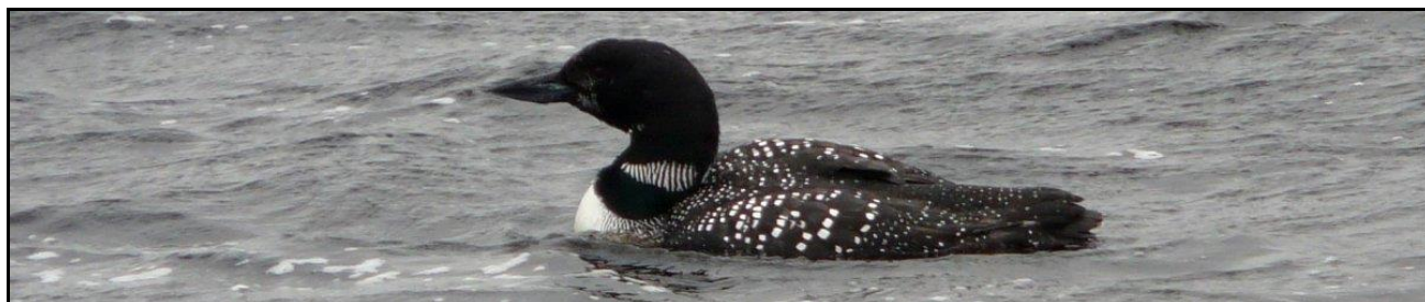
Common Loon at Shelburne, NS on Apr. 28, 2011