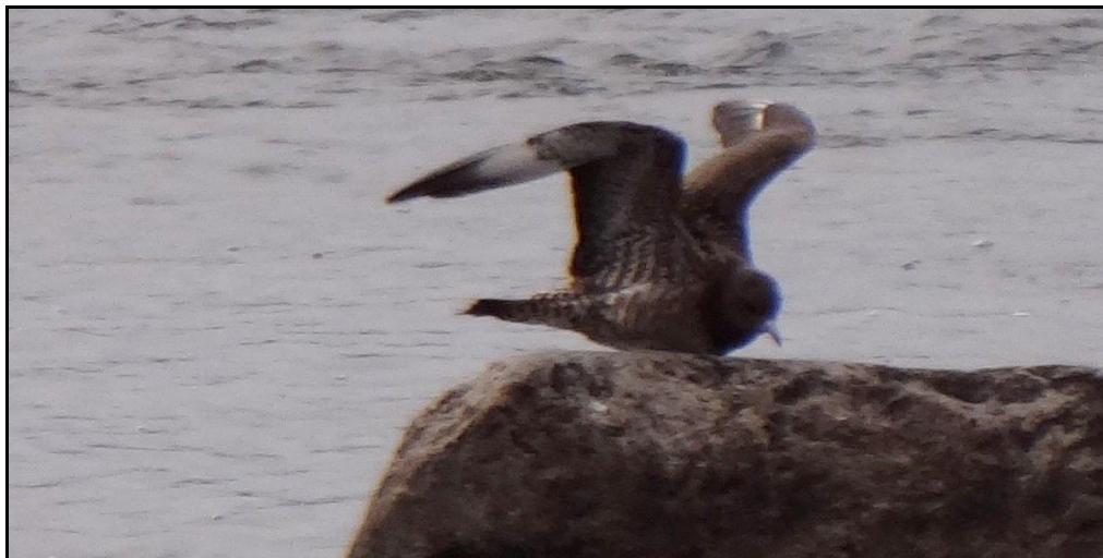
Parasitic Jaeger (intermediate morph juvenile) on the Ottawa River, Gatineau, QC on Oct. 27, 2011