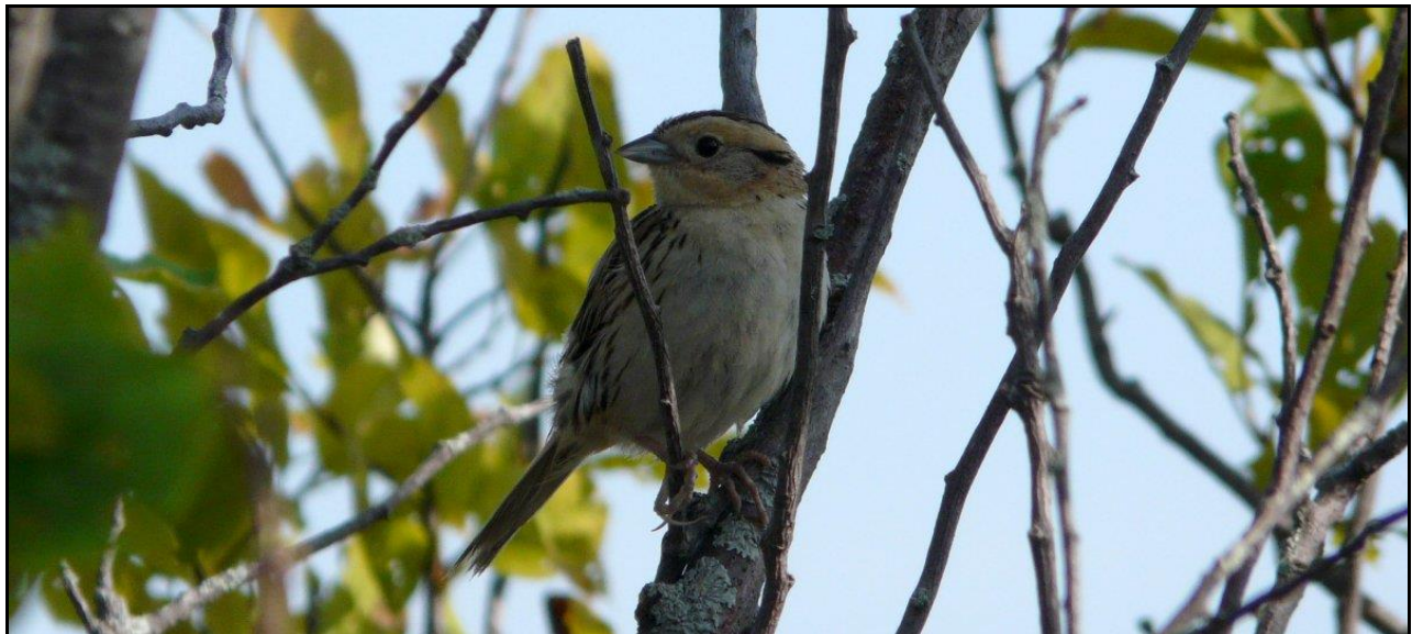
Le Conte's Sparrow in the United Counties of Prescott and Russell, ON on Aug. 13, 2011