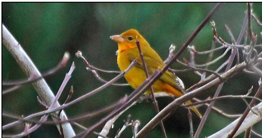
Summer Tanager at French Creek, Vancouver Island on Nov. 23, 2011 - 3rd BC record