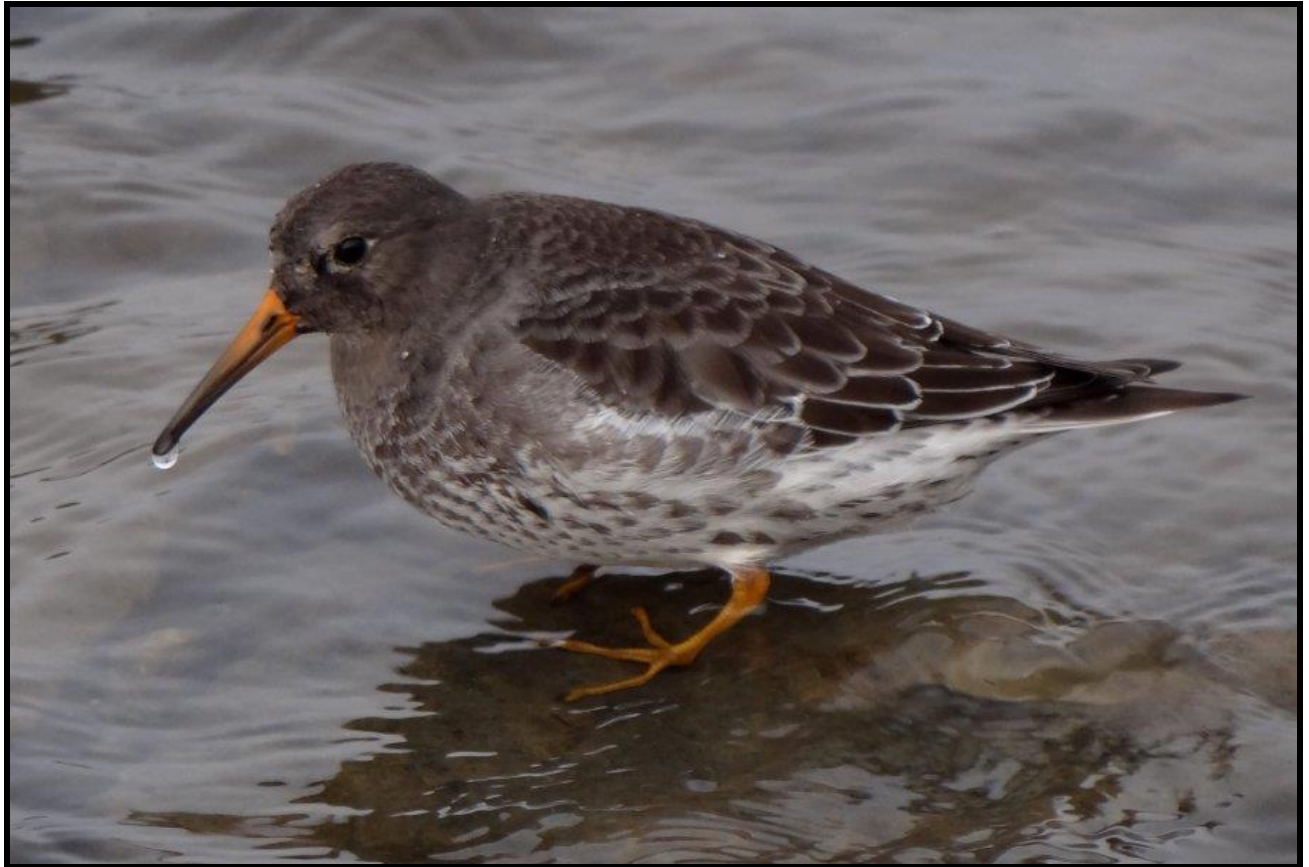
Purple Sandpiiper along the Ottawa River, Ottawa, ON on Nov. 26, 2011