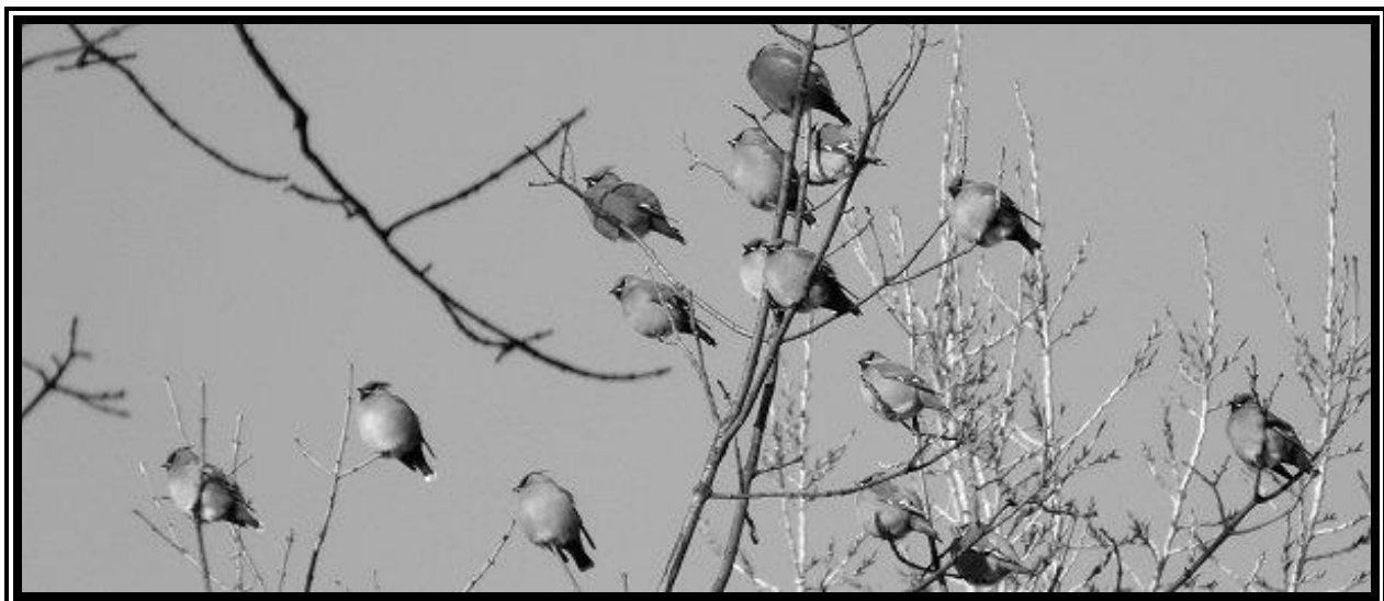
Bohemian Waxwings at the Champlain Bridge, Gatineau, QC – Jan. 2, 2008