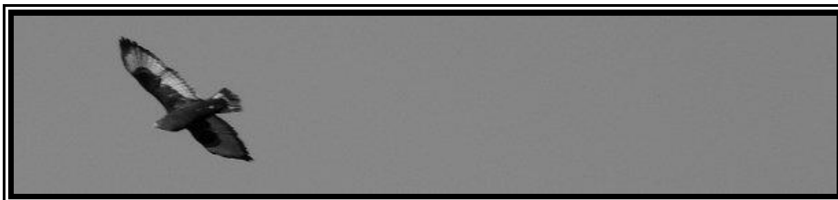
Rough-legged Hawk along Rifle Road, Ottawa, ON on Dec. 4, 2008

177 Ryan Dudragne, Swift Current SK (new)