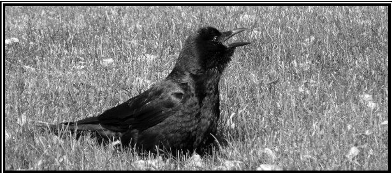
American Crow along Maybank Street, Ottawa, ON on June 27, 2009