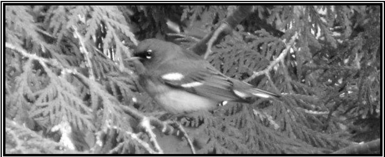
Northern Parula at Britannia Conservation Area, Ottawa, ON - May 10, 2008