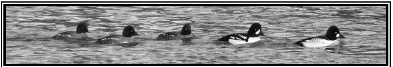
Barrow's Goldeneye with Common Goldeneye at Strathcona Park, Ottawa, ON – Dec. 27, 2009