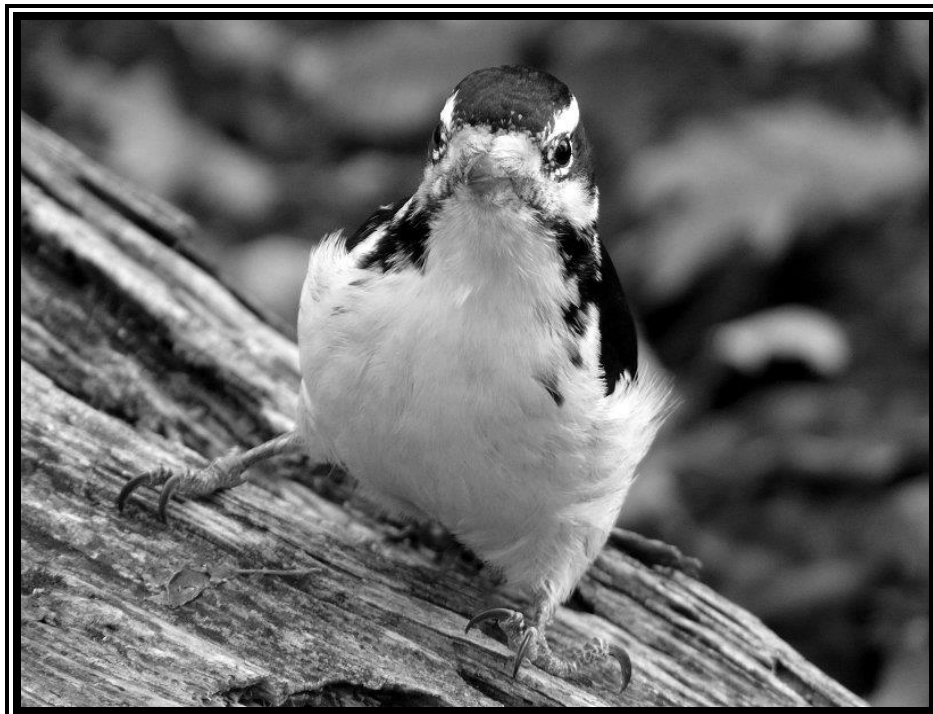
Downy Woodpecker at the Jack Pine Trail, Ottawa, ON on Dec. 12, 2009