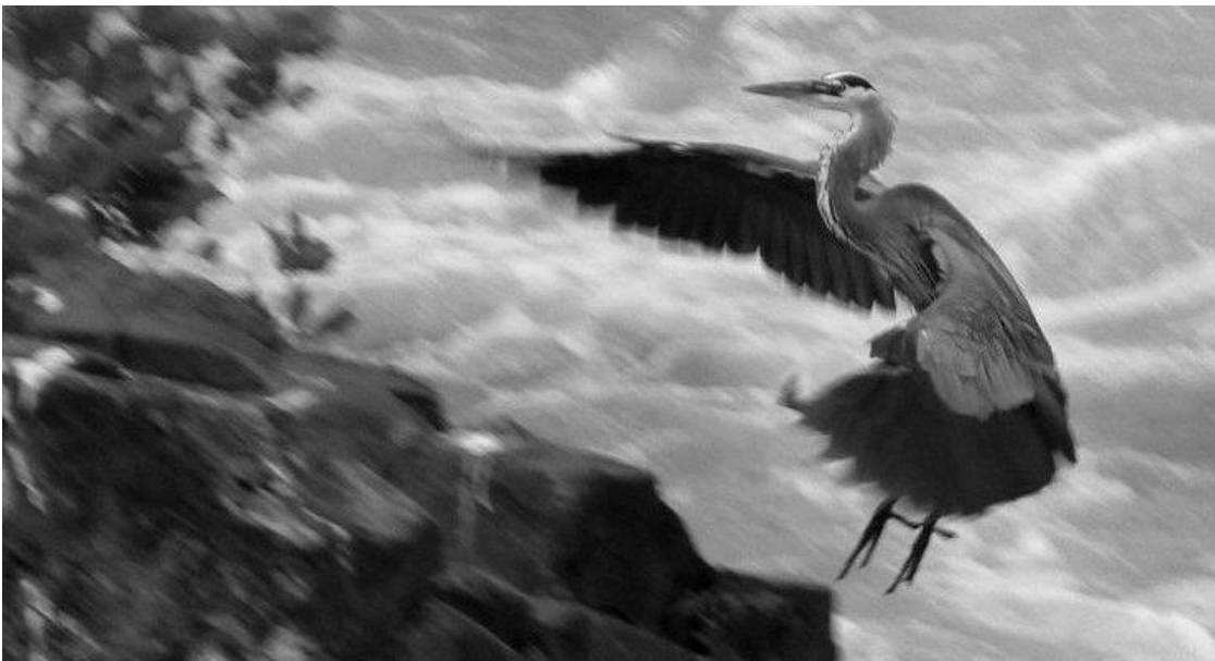
Great Blue Heron at Great Falls Park, VA - May 26, 2007