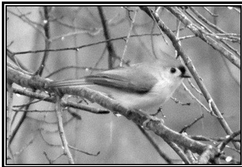
Tufted Titmouse at Mason Neck State Park, VA - Feb. 13, 2007