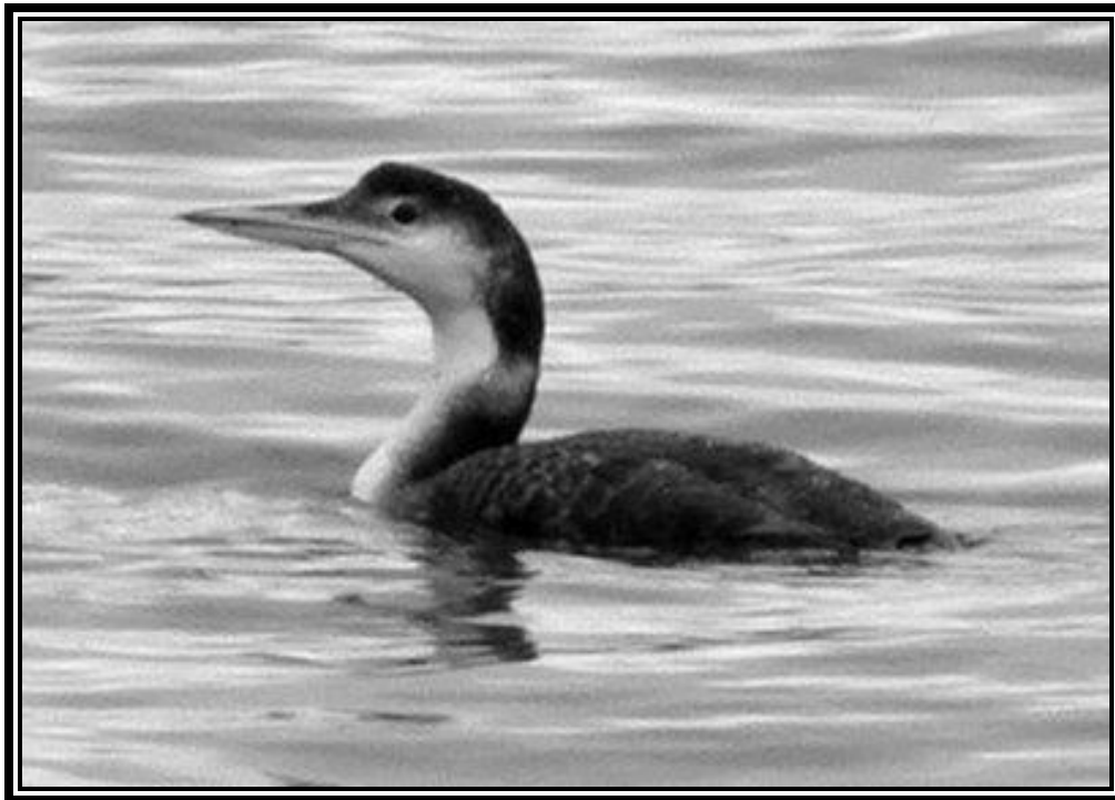
Common Loon south of Alburgh, VT - May 1, 2007