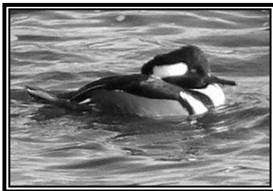
Hooded Merganser at Strathcona Park, Ottawa, ON - Dec. 1, 2007