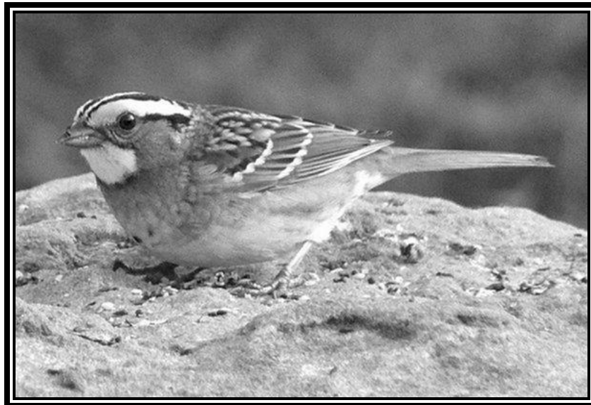
White-throated Sparrow at Shirleys Bay, Ottawa, ON – Apr. 29, 2007