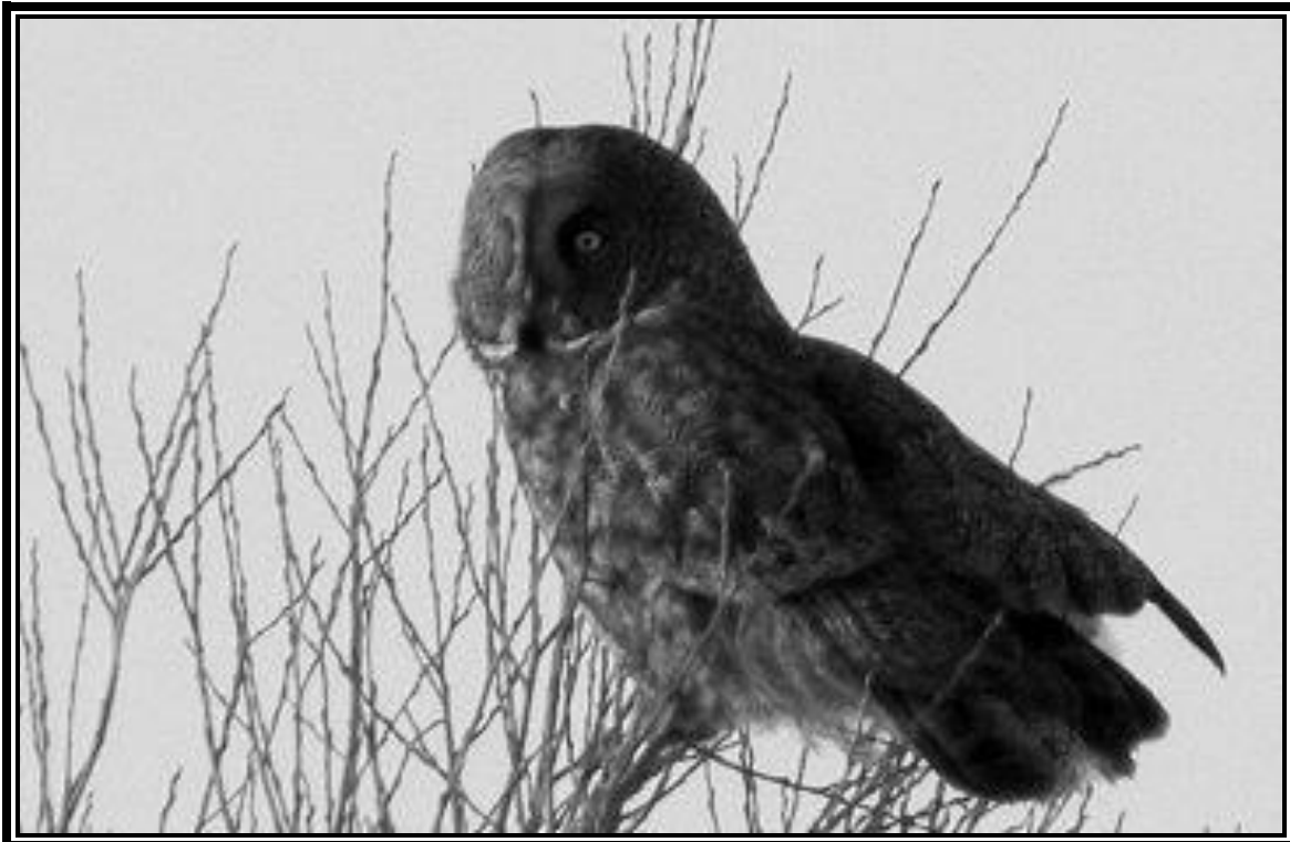
Great Gray Owl on Giroux Road, east of Ottawa, ON - Feb. 12, 2006