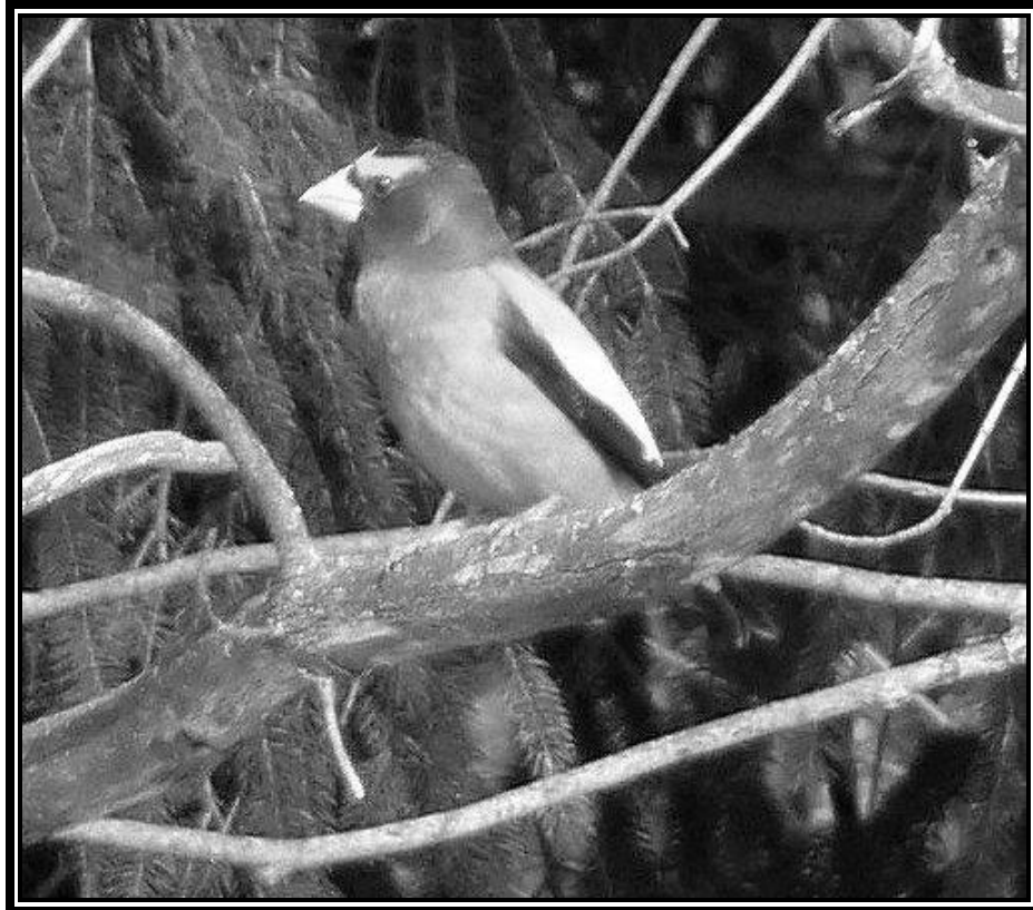
Evening Grosbeak in the Larose Forest, n. Lemieux, ON - Jan. 13, 2006