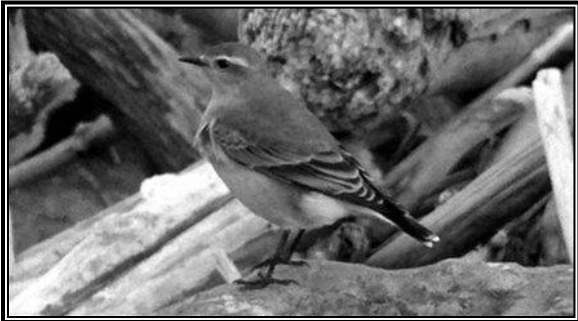
Northern Wheatear at Colchester Causeway, VT - Sep. 9, 2006 (part of the massive invasion of 2006)